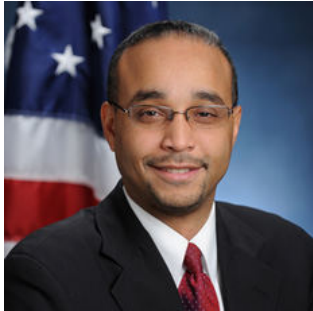
JOSE PERALTA STATE SENATOR 13 TH SENATORIAL DISTRICT