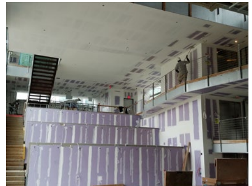
Painting on the 5th Floor