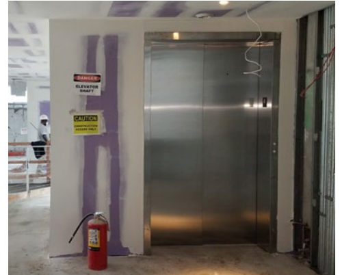
Installation of Elevator Doors