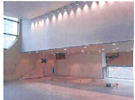
Installation of LED Light Fixtures.