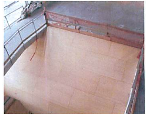
Bamboo Ceiling Panel Installation