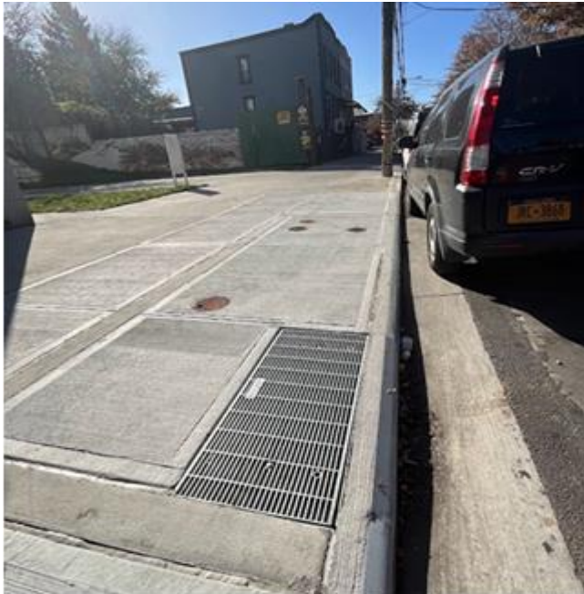
New IB with a concrete top at Troutman St, between Woodward Ave and Onderdonk Ave.