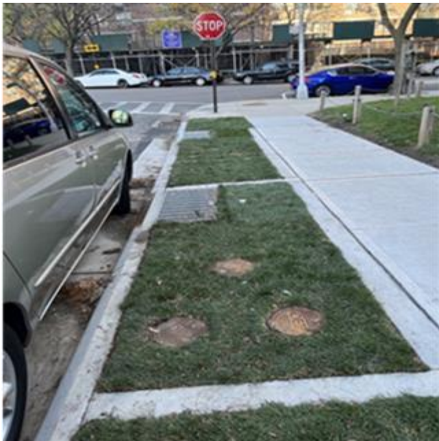
Two newly installed IBs with Grass Top at 60 th Street near 47 th Avenue