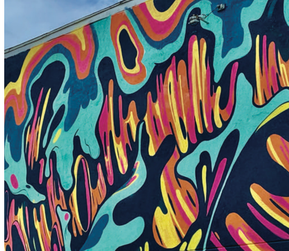
BARRELED Virginia Beach, VA