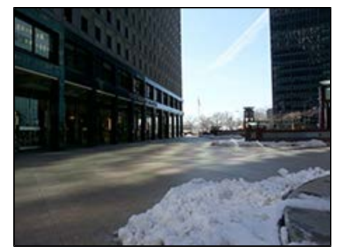
Plaza and arcade at 1 New York Plaza.

In April 2011, the City Planning Commission approved a text amendment to the Special Lower Manhattan District to allow tables and chairs in existing arcades along Water, Front, and South Streets by Chairperson Certification (see Lower Manhattan Arcades Text Amendment). The Commission noted that Water Street is not used by the majority of pedestrians as their north-south route and that the pedestrian environment and vitality of Water Street needs to be improved. The text amendment served as a tool to strengthen this important connection from the South Street Seaport area to The Battery, and several buildings have already taken advantage of this new provision.