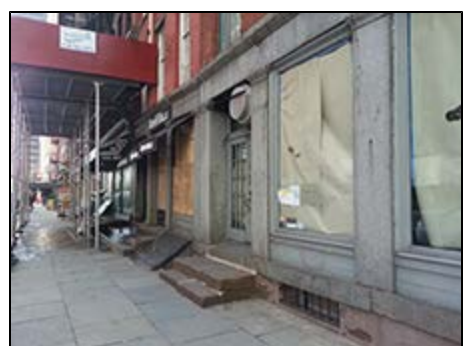
Small businesses that have yet to recover from the storm (March 9, 2013)

In October 2012 the inundation caused by Hurricane Sandy brought significant damage to Lower Manhattan, and exacerbated the broader challenges that have been facing Water Street. Many office tenants had to temporarily relocate to other parts of the City, and some still haven't returned. Local businesses were severely damaged, especially in the Seaport area, and businesses are only slowly coming back to life. Those buildings that sustained significant damage continue to be restored months after the storm.