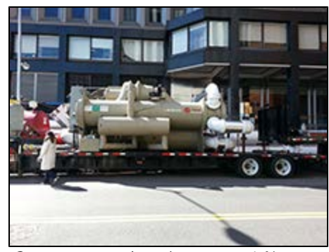
Generators and equipment at 1 New York Plaza (March 9, 2013).

Following the storm, DCP has been working closely with the Office of the Mayor, the Economic Development Corporation (EDC), and the Department of Transportation (DOT) on short-term efforts to rejuvenate the Water Street and Seaport areas. A major component of this effort is the ongoing development of a summer/fall program of events and activities that would utilize Water Street POPS. Farmers markets, small musical performances, outdoor fitness events, and food tastings during work hours and into the evenings are examples of the type of activities that are envisioned - the goal being to create excitement and economic activity, reinforce community connections, and reverse the cycle of negative news and perceptions associated with Water Street.