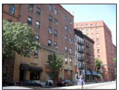
Greenwich Street, Existing Context (view to the north)