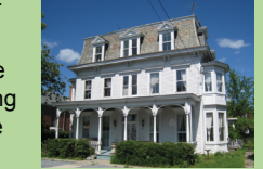
Samuel Pell House