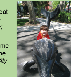
City Island Diner