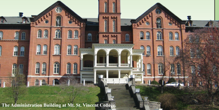
The Administration Building at Mt. St. Vincent College

70 At the end of the Avenue, you will find Johnny's Reef (2 City Island Ave; 718-885-2090) and Tony's Pier (1 City Island Ave; 718-885-1424). Sit outside, eat fried seafood, and watch the seagulls and boats in the water.