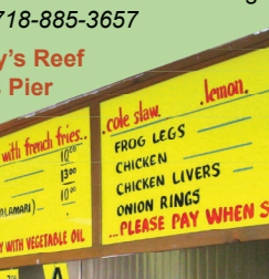
Johnny's Reef and Tony's Pier