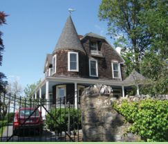
21 Tier Street