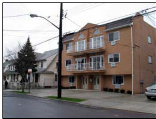
Out-of-context development permitted under existing R5 zoning.