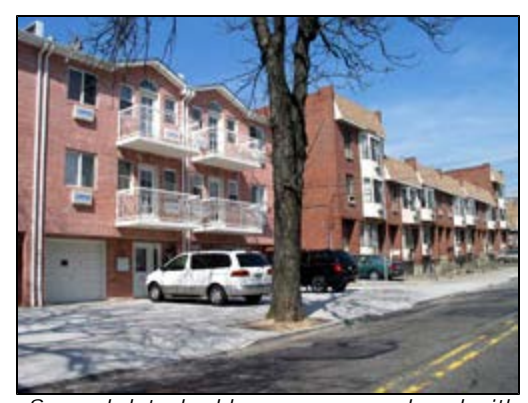
Several detached homes were replaced with these attached row houses on 168th Street.