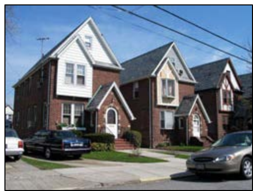
Typical development in proposed R3X District near 83rd Avenue.