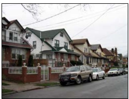
Typical residential development in existing R5 District near Gothic Drive. Proposed R4A District.