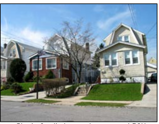
Single-family homes in proposed R3X District.