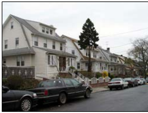
Typical one- and two-family detached residences in Jamaica Hill.