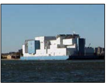
Prison barge in Hunts Point

About eight percent of the industrial area, excluding the Hunts Point Food Distribution Center, is vacant land/ buildings and about five percent consists of parking lots, salvage yards and waste-related uses. The land in the peninsula is limited and its use should be maximized to spur economic development and job opportunities for the community.