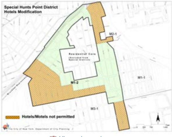
View a larger image.