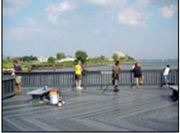
Tiffany Street Pier