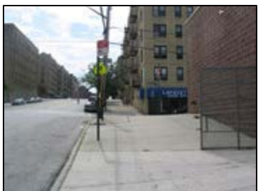
Mid-density apartment buildings along Lafayette Avenue in the residential core.

On July 23, 2008, the City Council adopted the actions with modifications to the Special Hunts Point District. <u>View the CC Modifications</u>, <u>View the CPC modifications</u> and <u>read the CPC Reports</u>.