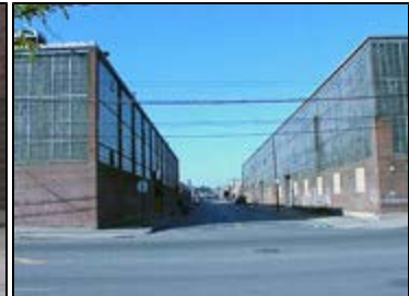
Hunts Point has been an industrial stronghold since the early 20th century, as evidenced by loft buildings on Worthen Street.