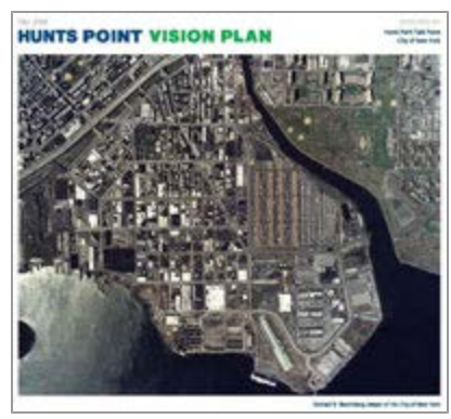
Hunts Point Vision Plan, © New York City Economic Development Corporation. All Rights Reserved.

The Task Force continues to meet on a quarterly basis at the offices of Bronx Community Board 2. Copies of the full Hunts Point Vision Plan are available from the <u>Hunts Point Vision Plan in 2004</u>