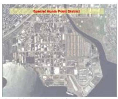
Special Hunts Point District Presentation - <u>View the</u> <u>presentation</u>

Within the Special Hunts Point District, two subdistricts would be established: