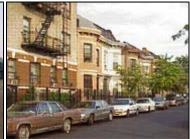
Manida Street - Residential Neighborhood: medium density apartment houses and row houses on Manida Street.

There are some small local retail shops along Hunts Point Avenue, but the residential community and the employees lack retail options in the area. The peninsula is under-served by large grocery stores or supermarkets. Hunts Point is also home to a growing arts and culture scene, led by the Point, which has been a vibrant and pro-active community center in the neighborhood. The remainder of the peninsula is comprised of a diverse mix of small industrial businesses, including food-related, manufacturing, construction, utility, auto-related, warehousing /distribution, and waste-related uses such as waste transfer stations.