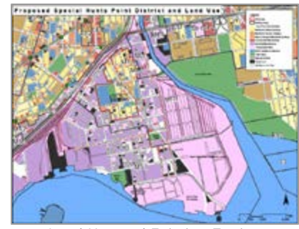
Land Use and Existing Zoning

An R6 zoning district is currently mapped over 22 blocks at the heart of the Hunts Point peninsula This residential district is made up of a mix of row-houses and medium-density apartment buildings varying in height from two to eight stories. R6 is a height factor district with no height