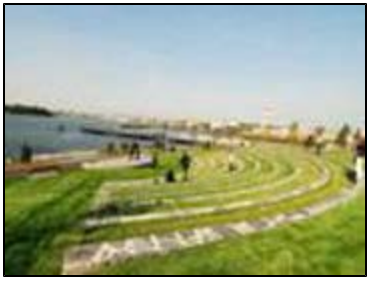
Barretto Point Park