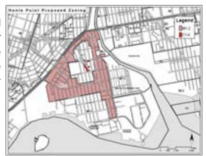
Proposed Zoning Map - Note: View a larger image

The proposed M1-2 district permits light manufacturing uses with the highest performance standards. M1 districts often serve as buffers between M2 and