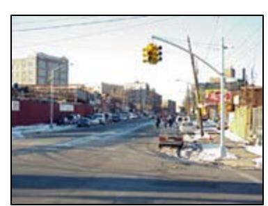
Open auto-related uses and residential development on Hunts Point Avenue

About eight percent of the industrial area, excluding the Hunts Point Food Distribution Center, is vacant land/ buildings and about five percent consists of parking lots, salvage yards and waste-related uses. The land in the peninsula is limited and its use should be maximized to spur economic development and job opportunities for the community.