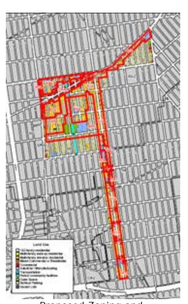
Proposed Zoning and Land Use Map as of September 26th, 2005 View a larger image

R7A: All or parts of 47 blocks are proposed to be rezoned from R6 to R7A, including Kings Highway from East 18th Street to Nostrand Avenue, much of Ocean Avenue from Kings Highway to Voorhies Avenue, and parts of three blocks between East 12th and 14th streets. In addition, two blockfronts on