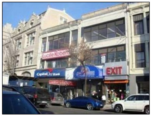
Proposed C4-4A district along Flatbush Avenue, between Church Avenue and Snyder Avenue

Also proposed is a zoning text amendment to permit an Inclusionary Housing bonus in the proposed C4-4A districts that would create incentives for the development and preservation of affordable housing. In the proposed C4-4A, there would be a maximum base FAR of 3.45 that could be increased up to 4.6 with the provision of affordable housing. The C4-4AA contextual height limits would apply to new developments (See <u>Proposed Text Amendment</u> below).