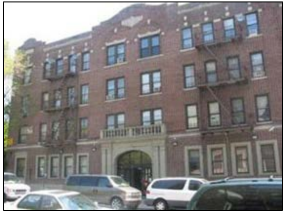
Proposed R6A district along Stratford Road between Caton Avenue and Church Avenue

R6A is a contextual district that allows all housing types. Buildings can be built to a maximum FAR of 3.0 The proposed R6A district has a maximum building height of 70 feet, with a base height of 40 to 60 feet. Street walls must line up with that of an adjacent building. Off-street group parking is required for 50% of the dwelling units but is waived if less than 5 spaces are required.