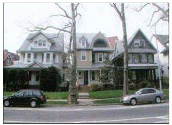
Proposed R4A district along Dorchester Road between Westminster Road and Argyle Road

R4A districts only allow detached, one and two family home with a maximum FAR of 0.9 (including the attic allowance ). The minimum lot width for the R4A district is thirty feet, with a minimum lot area of 2,850 square feet. Maximum building height is thirty-five feet, with a maximum perimeter wall of twenty-one feet high. The front yard must be a minimum of 10 feet and must be as deep as an adjacent front yard. Two side yards, each a minimum of 2 feet and totaling a minimum of 10 feet are required. The infill zoning provisions may not be used in the R4A district. One parking space is required per dwelling unit.