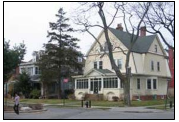
Proposed R1-2 district along Albemarle Road between Coney Island Avenue and Stratford Road

Two existing R1-2 districts would be extended on portions of seven blocks in two locations to protect their detached, single-family character. These areas are parts of historic districts of Prospect Park South and Ditmas Park, which are currently zoned R1-2, R6, and R7-1. The R1-2 district permits only detached, one-family residences with a maximum FAR of 0.5. The minimum lot width is 60 feet, with a minimum lot area of 5,700 square feet. There is no fixed maximum building height and envelopes are governed by the <u>sky exposure plane</u>. A 20 front yard is required, as are two side yards, each at least 8 feet, totaling a minimum of 20 feet. One parking space is required per dwelling unit.