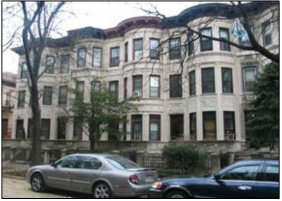
Proposed R6B district along St Paul Place between Woodruff Avenue and Crooke Avenue

R6B is a contextual district that allows all housing types. Buildings can be built to a maximum FAR of 2.0. Buildings must provide a base height of between 30 and 40 feet before setting back to a maximum height of 50 feet. The maximum lot coverage is 80% on corner lots and 60% on interior lots. Street walls must line up with that of an adjacent building. Parking is required for 50% of dwelling units, but waived if five or fewer spaces are required.