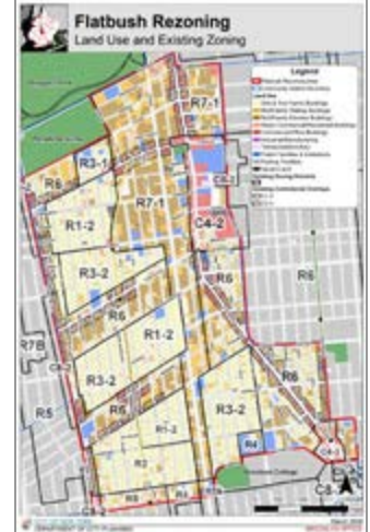
Land Use & Existing Zoning Wiew a larger image

R1-2 districts permit only single family detached homes with a minimum required lot area of 5,700 square feet and a sixty foot lot width. Residences require a minimum twenty foot front yard and two side yards are also required, totaling a minimum of twenty feet with a minimum of eight feet. R1-2 districts have a maximum floor area <u>ratio (FAR)</u> of 0.5 for residential and community facility uses. There is no maximum building height and building envelopes are controlled by the <u>sky exposure plane</u>. Each home is required to have at least one off-street parking space.