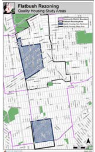
Quality Housing Study Areas View a larger image