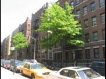
Neighborhood Context: Apartment buildings along Ocean Avenue in the R7-1 district.

Neighborhood Context: Attached homes along East 23rd Street, between Ditmas Avenue and Newkirk Avenue in the R6 district.