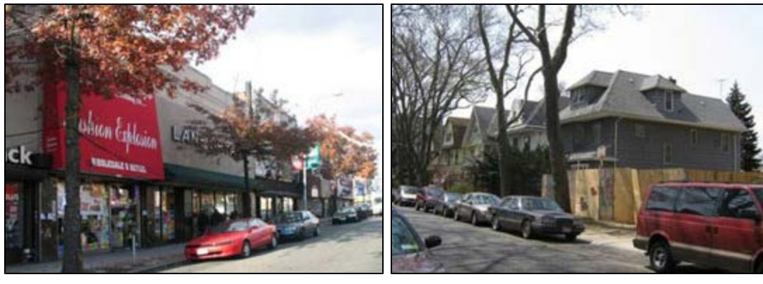
Neighborhood Context: Flatbush Avenue Commercial Corridor between Albemarle Road and Regent Place in the C4-2 district.