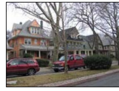
Neighborhood Context: Detached Homes at East 17th Street and Foster Avenue in the R2 district.

Just outside of the rezoning area, at the intersection of Avenue H and Flatbush Avenue is a major, regional transportation and commercial node known locally as "The Junction". The Junction remains a vibrant commercial area with a wide variety of commercial and mixed, commercial and residential uses. Also, churches, daycare centers and other community facilities dot the area. A large, enclosed mall was recently constructed immediately south of the rezoning area, just south of Avenue H. The mall is home to a Target, several restaurants and other shops.