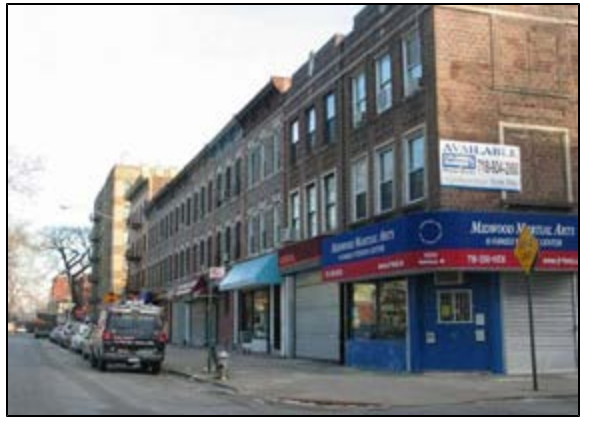
Proposed R5D district at the corner of Avenue H and East 13th Street