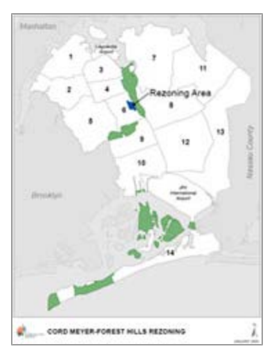
Context Niew a larger image

The proposed rezoning aims to protect the neighborhood's built character by ensuring future single-family building envelopes are more predictable and reflect the prevailing scale. This study was initiated in response to community concern that recent residential development is inconsistent with the neighborhood's established character.