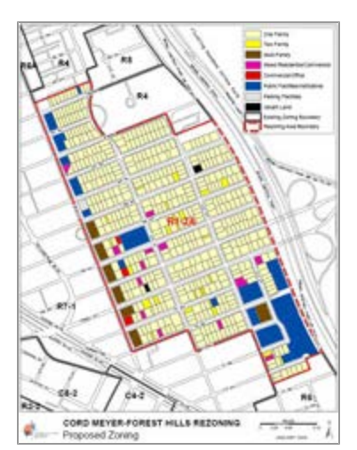
Proposed Zoning <u>View a larger image</u>

Floor Area Regulations Regarding the Exemption of Lowest-Floor Space that Includes a Garage: Under the current R1-2 the lowest story of a residence does not count as floor area if such floor contains a garage. This can result in buildings substantially taller and bulkier than surrounding buildings. The proposed R1-2A would allow a floor area exemption of only the floor space used for the garage, up to a maximum exemption of 300 square feet for a one-car garage, or 500 square feet for a two-car garage. Additionally, the new R1-2A district would