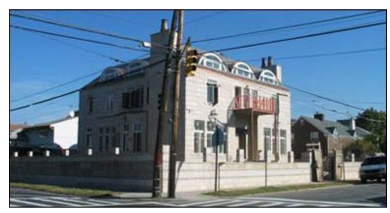
Out-of-context single-family detached house on Jewel Avenue.