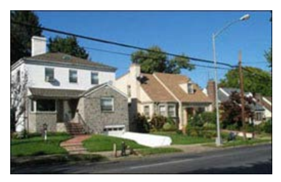
Typical single-family detached houses on 69th Road.