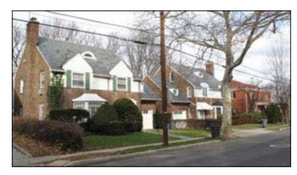
Typical single-family detached houses on 68th Avenue.