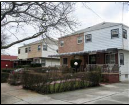
R3-1: One-family semi-detached, E.104th Street, between Avenue L and Avenue M