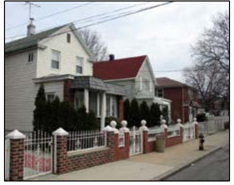
R4A: One-family detached, E.89th Street between Avenue K and Avenue L