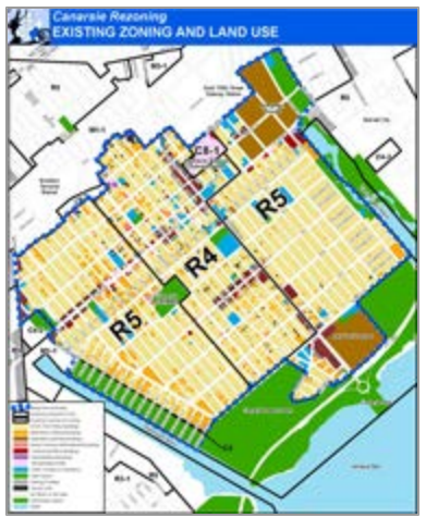
Existing Zoning Map -

Rockaway Parkway, Flatlands Avenue and Avenue L are the area's existing retail corridors, containing a mix of one-story commercial buildings and two -to three-story, mixed-use buildings with ground floor retail. Numerous open spaces and community facilities (e.g. schools, churches) are located throughout the rezoning area.