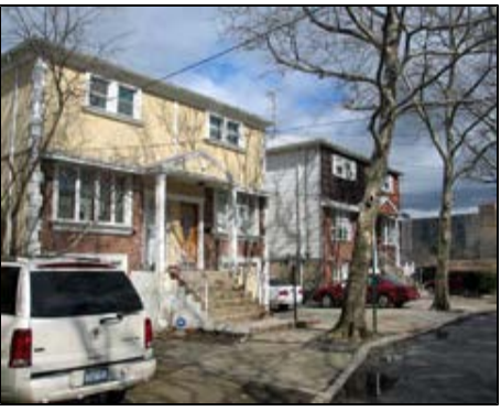
R4-1: One-family semi-detached, Flatlands 8th Street between E.108th Street and Fresh Creek Basin