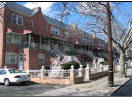
Multi-family attached, E.103rd Street, Avenue J