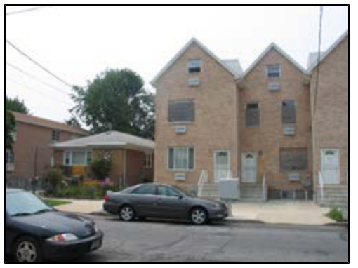
Existing R4 District: E.94th Street between Avenue L and Avenue M