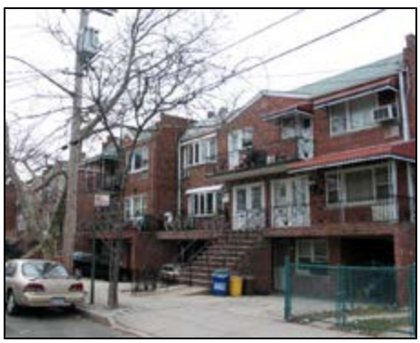
R5: E.80th Attached, E.80th Street between Paerdegat 5th and 6th Streets.