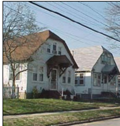
1930's-style house on 224th Street at 145th Avenue