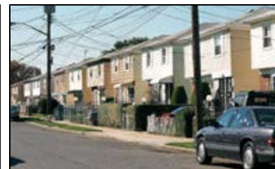
226th Street near 145th Road

During the last five years, more than 90 new housing units have been added, mostly two-family, semi-detached houses built on vacant land throughout the area.