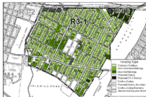
Proposed Zoning and Housing Type