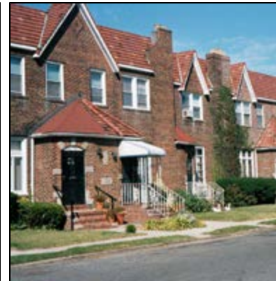
1940's-style house on 232nd Street at South Conduit Avenue

During the post-war decades, development was predominantly detached one- and two-family houses.