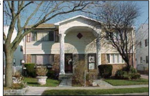
Two-family, semidetached home -- typical development in the proposed R3-1 zoning district

The Department of City Planning (DCP) has proposed zoning map changes for more than 85 blocks in the Brookville neighborhood in southeast Queens, Community District 13. The rezoning, one of the Department's lower-density rezoning initiatives in Queens, aims to maintain the prevailing one- and two-family character of the neighborhood and ensure that new residential development fits the context and scale of the area's existing housing mix.