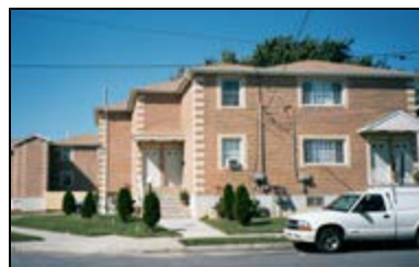
147th Avenue at 223rd Street