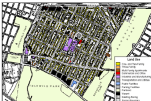
Existing Zoning and Land Use

DCP also proposes to establish a C1-3 overlay districts on four block fronts in Brookville that have long been developed with commercial uses serving the local community. Commercial overlays would be mapped on two sections of the east side of 228th Street between 147th Avenue and 145th Road opposite the manufacturing area and at the corner of South Conduit Avenue and Lansing Avenue. An existing C2 overlay district on South Conduit Avenue between Springfield Boulevard and 224th Street would be changed to C1-3 to limit commercial uses to local retail and personal service shops that would serve the immediate residential neighborhood.