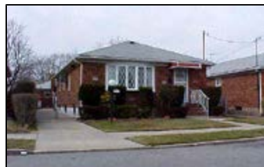
227th Street near 143rd Road