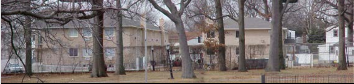
View from Brookville Park toward 232nd Street between 145th and 146th Avenue

The proposed R3-1 zoning district will prevent future multi-family buildings, which would be inconsistent with the character and scale of the surrounding area, while continuing to allow one- and two-family detached and semi-detached houses.