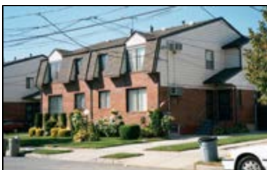
224th Street at 145th Avenue

During the last five years, more than 90 new housing units have been added, mostly two-family, semi-detached houses built on vacant land throughout the area.