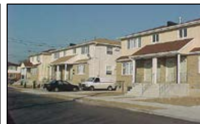
228th Street at 146th Avenue

Under the existing R3-2 zoning, multi-family apartments are allowed as-of-right, such as this 25-unit apartment complex constructed on lots previously occupied by single family houses.