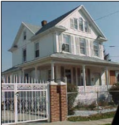
1920's-style house on 221st Street at 145th Avenue

Development in Brookville between 1920 and 1940 was a mix of single-family frame buildings and brick row houses.