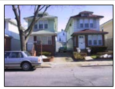
West 3rd Street near Avenue Pdetached house in the proposed R4A

R4A , a residential district that permits only one- and two-family detached houses, is proposed for seven small areas – about five percent of the rezoning area – where detached houses, often on large lots, predominate. Three of the areas are now zoned R6 and four R5. The R4A designation allows an FAR of 0.9 and requires side yards and one parking space for each dwelling unit. It has a perimeter wall height limit of 21 feet and an overall permitted building height of 35 feet.