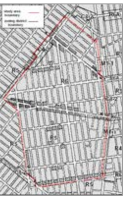
Existing Zoning Map Niew a larger map

North of Kings Highway, an R6 residential district permits construction of tall towers on large lots under the standard 1961 height factor regulations, which have no height limits and a maximum floor area ratio (FAR) of 2.43 for residential buildings. The optional Quality Housing program permits an FAR of 2.2 on narrow streets and 3.0 on wide streets, but limits building heights to 55 feet and 70 feet, respectively. Under R6 regulations, community facility buildings (such as hospitals, schools, houses of worship and medical offices) and mixed residential/community facility buildings can achieve an FAR of up to 4.8. Many of the out-of-scale buildings constructed recently in the neighborhood include both residential and community facility uses and, as a result, are much bulkier and taller than surrounding buildings.