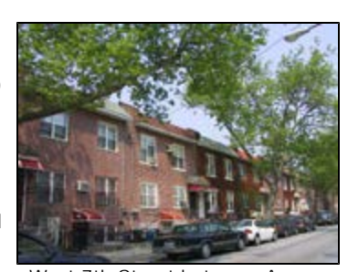
West 7th Street between Avenue S and T - Attached housing in the proposed R5B