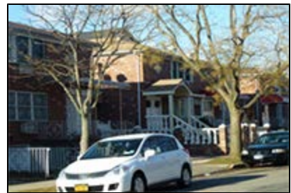
Two-family semi-detached houses on Pontiac Street, north of Braddock Avenue within the proposed R4-1 district. (Bellerose)

The R4-1 district permits one- and two-family detached or semi-detached residences. The maximum FAR is 0.9, which includes a 0.15 attic allowance. The minimum lot width and lot area depend upon the housing type: detached residences require a minimum 25-foot lot width and 2,375 square feet of lot area. Semi-detached residences require a minimum 18-foot lot width and 1,700 square feet of lot area. The maximum building height is 35 feet, with a maximum perimeter wall height of 25 feet. Community facilities are permitted at a maximum FAR of 2.0. One parking space is required for each dwelling unit.