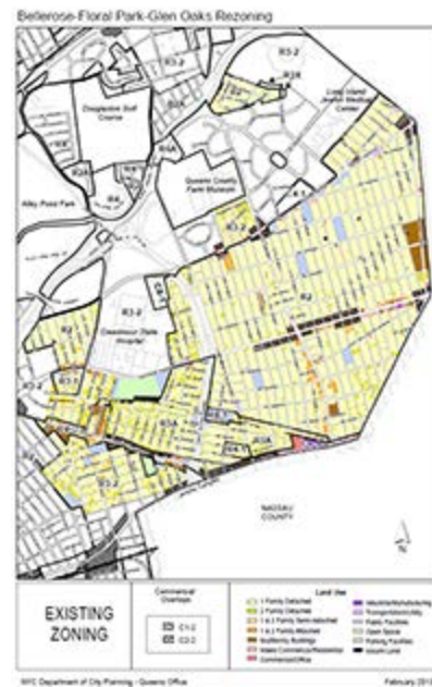
Existing Zoning Map

The current zoning does not adequately ensure that future development will reinforce the prevailing character of these suburban communities. View the zoning comparison chart.