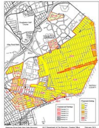
Proposed Zoning Map

The proposed zoning changes would affect more than 9,843 lots on 411 blocks. The proposed rezoning will replace all or portions of the existing R2, R3A, R3-1, R3-2, R4, R4-1 and C8-1 zones with new lower density and contextual districts which include R1-2, R2, R2A, R3A, R3X, R3-1, R3-2, R4-1 and R4. The proposed zoning districts will better protect the low-density character of these suburban neighborhoods and make new development more predictable by establishing firmer height limits and requiring front yard depths that better reflect adjacent yard depths. Additionally, to protect residential blocks from commercial intrusion, depths of commercial overlays will be shortened from 150 feet to 100 feet, and some commercial overlays will be eliminated where only residential uses exist. In turn, commercial overlays will be mapped on certain block fronts to reflect and reinforce existing commercial uses found along Jericho Turnpike, Braddock Avenue, Hillside Avenue and Union Turnpike. View the zoning comparison chart.