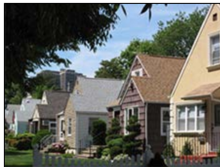
Single-family homes at 267th Street and 77th Avenue (New Hyde Park)