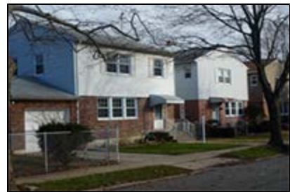
Single-family detached residences on 221st Place within the proposed R2 district. (Bellaire)

An R2 district is proposed on a portion of one block currently zoned R4 and developed with single family detached homes. The proposed R2 is an extension of an existing adjacent R2 district. The R2 district permits only single-family, detached residences on lots that have a minimum area of 3,800 square feet and a minimum lot width of 40 feet. The maximum floor area ratio (FAR) is 0.5. There is no maximum building height; instead, the building's maximum height is determined by its sky exposure plane, which has a varying height depending on where the building is located on its zoning lot beyond the minimum required front yard. A 15-foot minimum front yard is required. Community facilities are permitted at a maximum FAR of 0.5. One parking space is required.