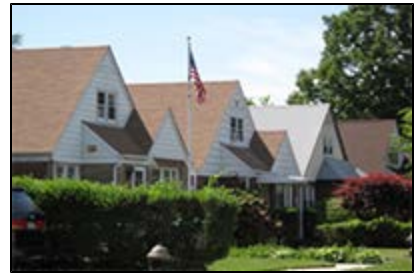
Single-family detached homes on 267th Street between 76th and 77th Avenues within the proposed R2A district. (New Hyde Park)

of 40 feet. The maximum FAR is 0.5. The maximum building height is 35 feet, with a maximum perimeter wall height of 21 feet. The front yard of a new building must be at least as deep as an adjacent front yard with a minimum depth of 15 feet. Community facilities are permitted at an FAR of 0.5, and up to 1.0 FAR by special permit. One parking space is required.