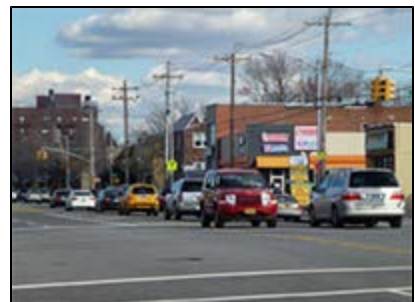
Commercial and residential properties along Hillside Avenue, east of Little Neck Parkway.

The proposed updates to the commercial zoning districts would replace existing C1-2 and C2-2 districts and generally reduce the depth of commercial overlays from 150 feet to 100 feet to prevent commercial uses from encroaching onto residential side streets. New C1-3 and C2-3 commercial overlays are also proposed in certain locations along Hillside Avenue and Jericho Turnpike in order to recognize existing commercial uses and provide new business location opportunities. Along Union