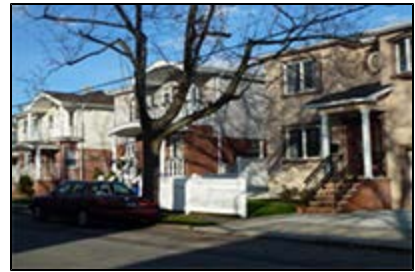
One- and two-family homes on 249th Street, south of Elkmont Avenue within the proposed R3X district. (Glen Oaks)

The R3X district permits one- and two-family detached residences on lots that have a minimum area of 3,325 square feet and a minimum lot width of 35 feet. The maximum FAR is 0.6, which also includes a 0.1 attic allowance. The maximum building height is 35 feet, with a maximum perimeter wall height of 21 feet. The front yard of a new building must be at least as deep as an adjacent front yard with a minimum depth of 10 feet and a maximum depth of 20 feet. Community facilities are permitted at a maximum FAR of 1.0. One parking space is required for each dwelling unit.