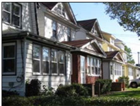
Single-family homes at Commonwealth Boulevard and 88th Road (Bellerose)