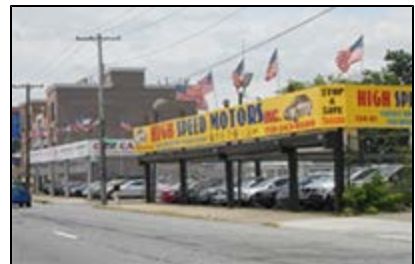
Under developed block fronts along Jericho Turnpike, east of 249th Street within the proposed R4 district with a C2-3 commercial overlay. (Bellerose)

The R4 district allows the same variety of housing types as the R3-2 district but at a slightly higher density. The maximum allowable FAR is 0.9, which includes a 0.15 attic allowance. Detached residences require a minimum lot area of 3,800 square feet and a minimum lot width of 40 feet. Semi-detached and attached residences require a minimum lot area of 1,700 square feet and a minimum lot width of 18 feet. The maximum building height is 35 feet, with a maximum perimeter wall height of 25 feet. In a predominantly built up area, a maximum FAR of 1.35 is permitted with the R4 infill provision. Front yards must be 10 feet deep or, if deeper, a minimum of 18 feet. Community facilities are permitted at an FAR of 2.0. One parking space is required for each dwelling unit.