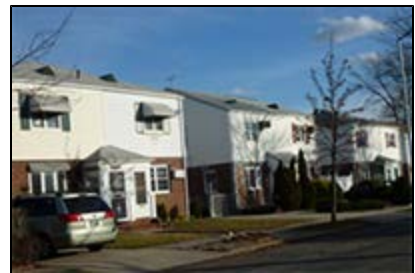
Two-family, semi-detached homes on Elkmont Avenue within the proposed R3-1 district (Glen Oaks)

The R3-1 district permits one- and two-family detached or semi-detached residences. The maximum FAR is 0.6, which includes a 0.1 attic allowance. The minimum lot width and lot area depend upon the housing configuration: detached residences require a minimum 40-foot lot width and 3,800 square feet of lot area; semi-detached residences require at least 18 feet of width and 1,700 square feet of lot area. The maximum building height is 35 feet, with a maximum perimeter wall height of 21 feet. Community facilities are permitted at a maximum FAR of 1.0. One parking space is required for each dwelling unit.