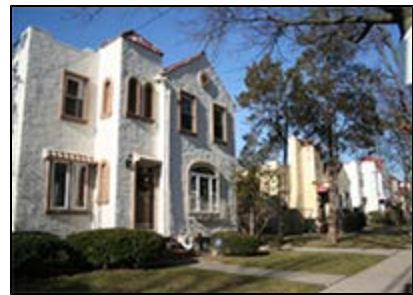
Single-family detached residences on Seward Avenue within the proposed R1-2A district. (Bellaire)

An R1-2 district permits only single-family, detached residences on lots that have a minimum area of 5,700 square feet and a minimum lot width of 60 feet. The maximum FAR is 0.5. The maximum building height is 35 feet, with a maximum perimeter wall height of 25 feet. The front yard of a new building must be at least as deep as an adjacent front yard with a minimum depth of 20 feet. Community facilities are permitted at an FAR of 0.5, and up to 1.0 FAR by special permit. One parking space is required