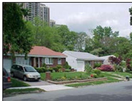
Single-family detached homes at 263rd Street and 72nd Road (Royal Ranch)