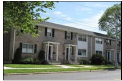
Garden apartments on Langdale Street south of 81st Avenue within the proposed R3-2 district (Floral Park)

The R3-2 district is the lowest-density general residence district in which multi-family structures are permitted. A variety of housing types are permitted including garden apart-ments, row houses, semi-detached and detached houses. The maximum FAR is 0.6, which includes a 0.1 attic allowance. Minimum lot width and lot area depend upon the housing configuration: detached residences require a 40-foot lot width and 3,800 square feet of lot area; other housing types require lots that have at least 18 feet of width and 1,700 square feet of lot area. The maximum building height is 35 feet, with a maximum perimeter wall height of 21 feet. Front yards must be at least 15 feet deep. Community facilities are permitted at an FAR of 1.0. One parking space is required for each dwelling unit.