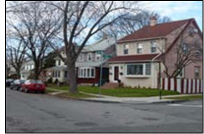
One- and two-family homes on 87th Avenue at 232nd Street within the proposed R3A district. (Bellaire)

The R3A district permits one- and two-family detached residences only on lots that have a minimum area of 2,375 square feet and a minimum lot width of 25 feet. The maximum FAR is 0.6, which also includes a 0.1 attic allowance. The maximum building height is 35 feet, with a maximum perimeter wall height of 21 feet. The front yard of a new building must be at least as deep as an adjacent front yard with a minimum depth of 10 feet and a maximum depth of 20 feet. Community facilities are permitted at a maximum FAR of 1.0. One parking space is required for each dwelling unit.