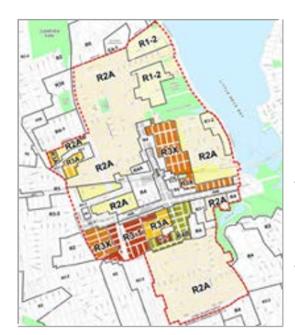
Proposed Zoning Map <u>View a larger image</u>.

View an update to the Department's presentation materials that reflect the CPC's modifications regarding the proposed R2A framework.