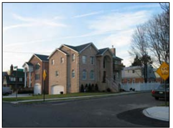
221st Street at 39th Avenue