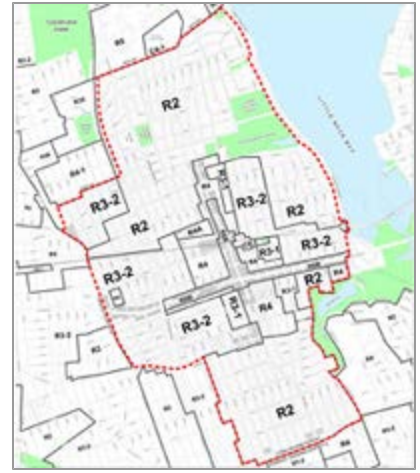
Existing Zoning Map Niew a larger image.

Like other Queens neighborhoods of its size, Bayside has a variety of land uses and building types, most in the form of low-scale residential and commercial development. The area's predominant context is characterized by low-density one-and two-family, detached and semi- detached residential development. While much of the earliest development in Bayside dates to the middle of the 1800s, most of the area's residential and commercial structures were built after the extension of the Long Island Rail Road in the late 1800s. The period of greatest construction growth took place in the 1930s and after World War II. Of the 7,046 lots proposed to be rezoned, 95 percent are residentially developed, most of them with detached residences.