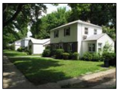
Single detached homes on 213th Street in proposed R1-2A district

The proposed R1-2A zoning would maintain the existing low-density character of detached, single-family housing on larger lots and it will ensure that future development would be closer in scale to surrounding residences.