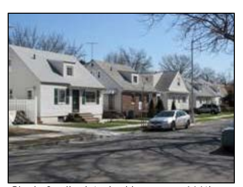
Single family detached homes on 166th Street in an existing R2 district