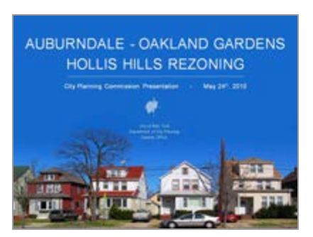
View the presentation