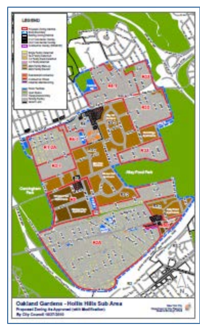
Oakland Gardens-Hollis Hills Sub Area - Proposed Zoning As Approved (with Modifications) By City Council 10/27/2010 View a larger image.