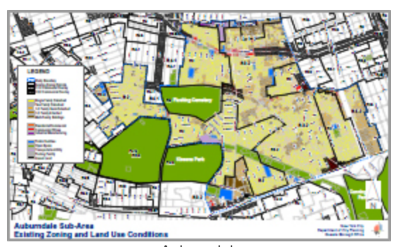
Auburndale New a larger image

The Auburndale-Oakland Gardens-Hollis Hills rezoning area is currently comprised of seven <u>residential</u> zoning districts R1-2, R2, R3-1, R3-2, R4, R4-1 and R5 which allow a variety of housing types and building envelopes that are inconsistent with the prevailing scale, density and built character of these neighborhoods. <u>Commercial overlay districts</u> within the rezoning area (C1-1 and C2-2) are mapped along portions of 46th Avenue, the Long Island Expressway, Bell Boulevard, Springfield Boulevard and Union Turnpike.