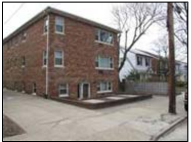
Out of character multi-family building on 45th Avenue in an existing R3-2 district