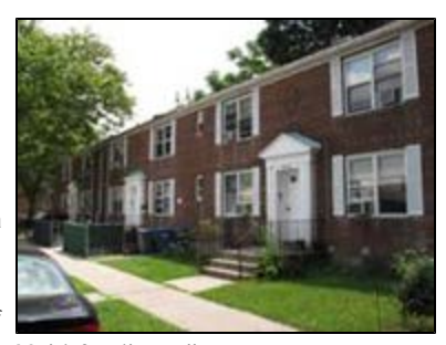
Station Road in a proposed R4

The R4 district permits a variety of housing types, including detached, semidetached, attached and multi-family buildings. The maximum FAR is 0.9, which includes a 0.15 attic allowance. Detached residences require a minimum lot area of 3,800 square feet and a minimum lot width of 40 feet. Semi-detached and attached residences require a minimum of 1,700 square feet in area and a minimum lot width of 18 feet. A front yard of at least 10 feet is required, and if the front yard exceeds 10 feet, then a front yard depth of 18 feet is required. The Multi-family walk-up apartments on maximum building height is 35 feet with a maximum perimeter wall height of 25 feet. Community facilities are permitted at an FAR of 2.0. One parking space is required for each dwelling unit.