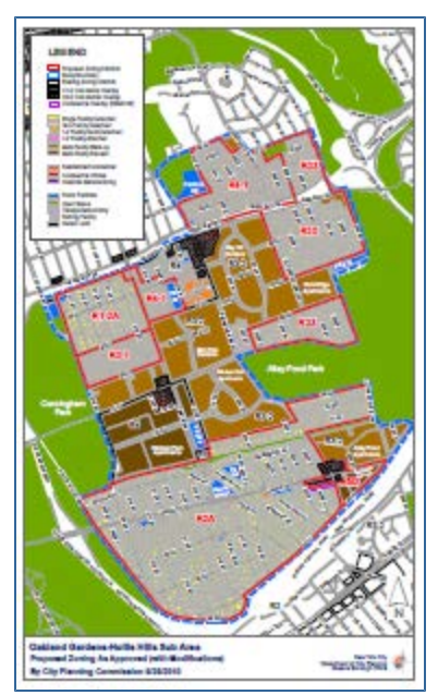
Oakland Gardens-Hollis Hills Sub Area - Proposed Zoning As Approved (with Modifications) By City Planning Commission 9/29/2010