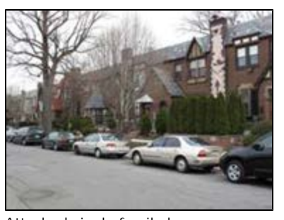
172nd Street in a proposed R4B

The R4B district permits one- and two-family residences and is primarily characterized by low-rise row houses. The maximum FAR is 0.9. The maximum building height is 24 feet. Detached residences require a minimum lot area of 2,375 square feet and a minimum lot width of 25 feet. All other housing types require a minimum area of 1,700 square feet and a minimum lot width of 18 feet. A front yard of at least 5 feet is required and must be as deep as an adjacent front Attached single family homes on yard up to 20 feet. Community facilities are permitted an FAR of 2.0. One parking space is required for each dwelling unit and it is not permitted in the front yard.