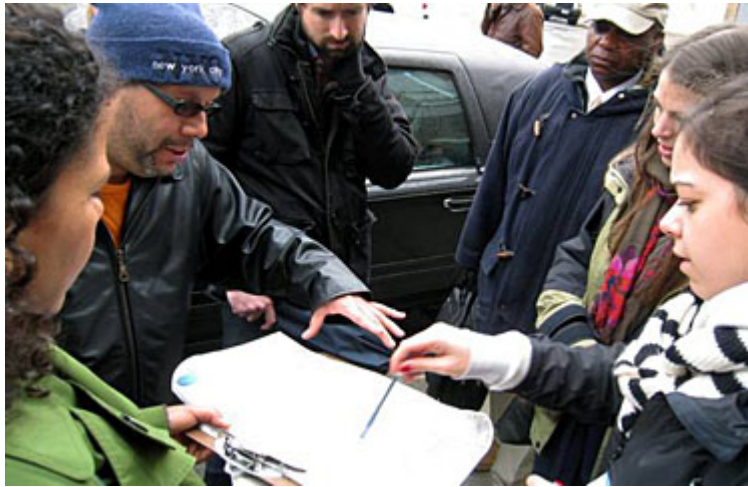
Residents tour the neighborhood with DCP facilitators and volunteers from local graduate planning schools during the first part of the event.