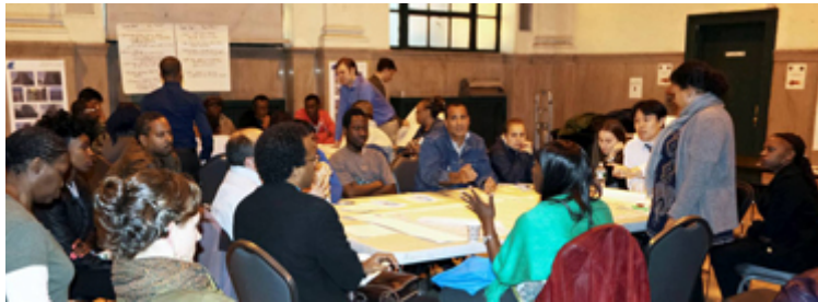
Planners and Urban Designers from the New York Department of City Planning discuss issues and opportunities with community residents and stakeholders.

After the successful participation in the Cypress Hills Verde Summit and the Broadway Junction Community Visioning event, the Department of City Planning Sustainable Communities East New York team held a visioning session at Community Board 5 for residents living in the Sustainable Communities East New York study area east of Pennsylvania Avenue between Pitkin Avenue, Conduit Avenue and Fulton Street. The event on May 10, 2012 was attended by more than 30 community residents and other stakeholders. After a virtual tour of the area, two workshop groups identified “good” and “bad” places in the area and helped the DCP project team identify issues and opportunities in the area.