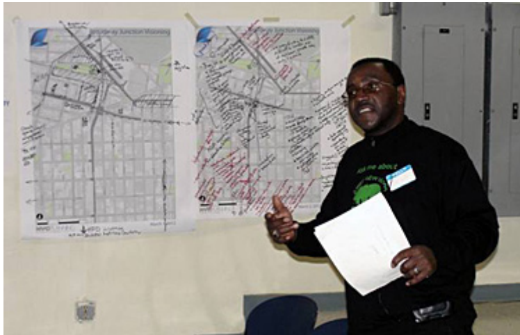
An area resident presents his group's recommendations for the Broadway Junction neighborhood to the rest of the event participants.

If you have any comments, or if you are interested in attending future community events, please contact us with the link at the bottom of the page. There will be a number of ways to get involved over the next year, so we look forward to hearing from you.