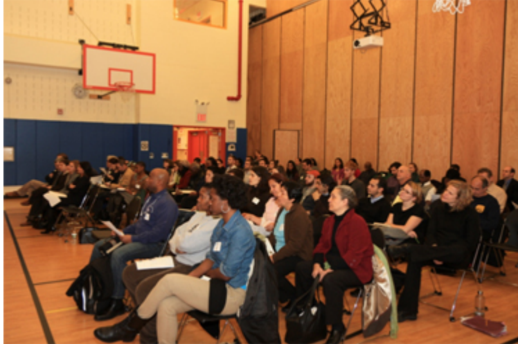
More than 70 people participated in the Sustainable Communities Town Hall in East New York, Brooklyn on February 9, 2012.

The City Planning Commissioner addressed the first Sustainable Communities Town Hall which was held on February 9, 2012 at the Cypress Hills Community School in East New York.