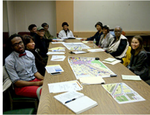
City Planning staff meet with the Community Board 16 Land Use Committee.

If you have any comments, or if you are interested in attending future community events, please contact us using the link at the bottom of the page.