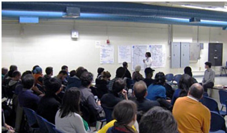
Another area resident explains her break-out group's issues and recommendations at the end of the Visioning Forum.

If you have any comments, or if you are interested in attending future community events, please contact us with the link at the bottom of the page. There will be a number of ways to get involved over the next year, so we look forward to hearing from you.