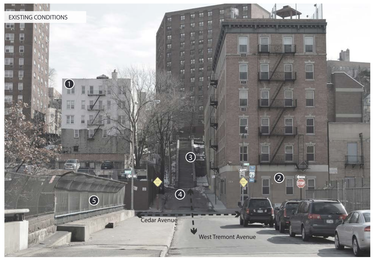
FIGURE 4 | Existing Conditions at Cedar Avenue and West Tremont Avenue