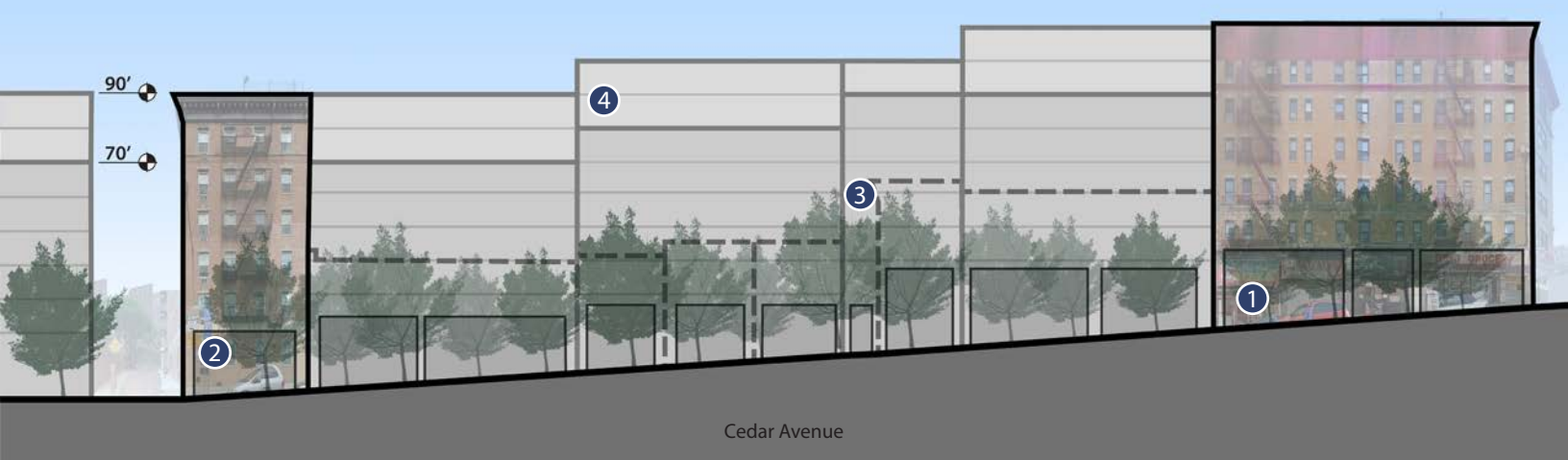
FIGURE 6 | (Top) Existing Conditions along Cedar Avenue. (Bottom) Proposed Improvements along Cedar Avenue.