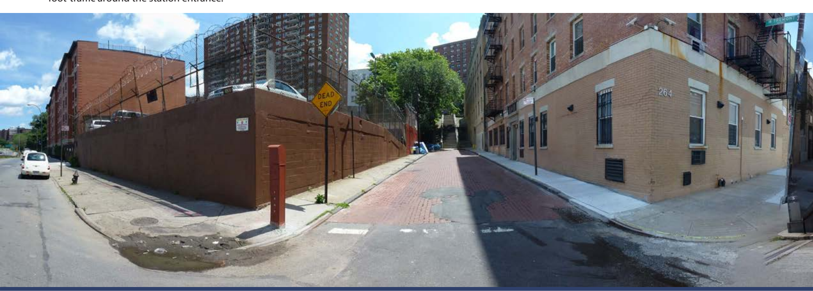
FIGURE 4 | (Bottom) Cedar Avenue and West Tremont Avenue; ground floor uses are largely inactive with little commercial development and foot-traffic around the station entrance.