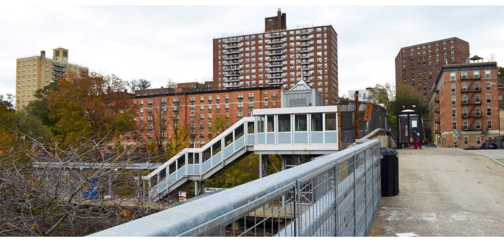
FIGURE 1 | Entrance of Morris Heights station area, intersection of West Tremont Avenue and Cedar Avenue.