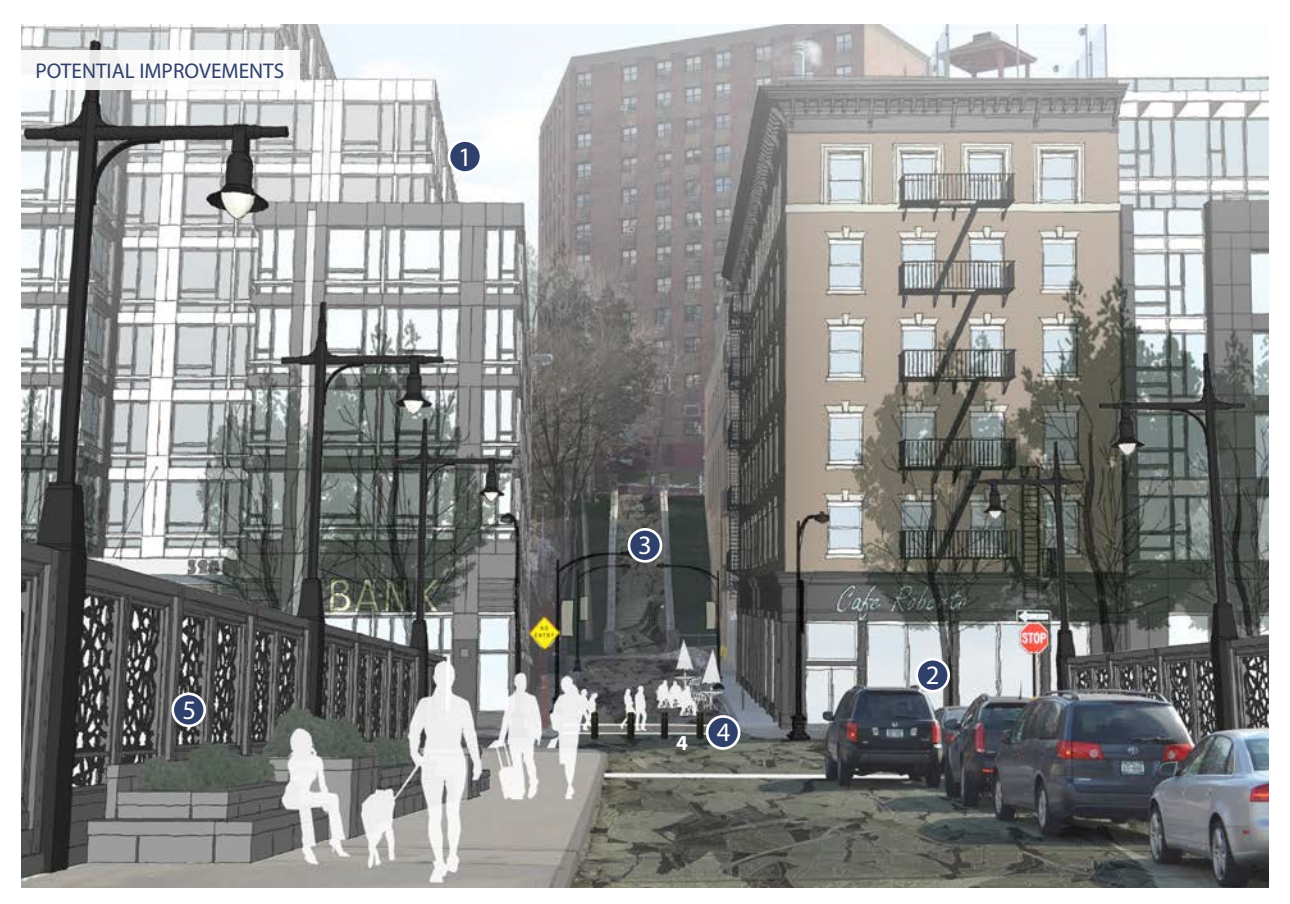
FIGURE 5 | Potential Improvements at Cedar Avenue and West Tremont Avenue