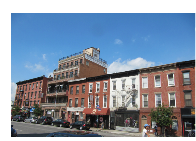
Commercial (stores, offices, salons, estaurants, theaters, art galleries, hotels,