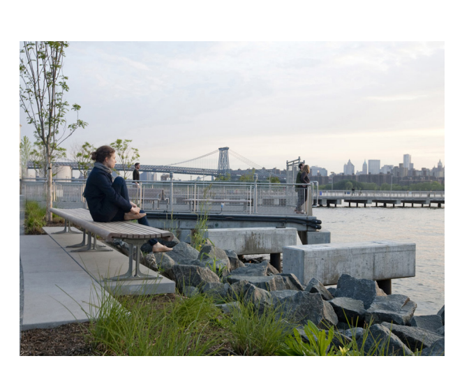
Waterfront Access Plans