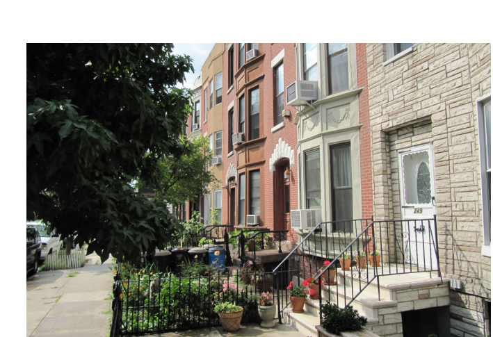
(apartment buildings, single family homes, multiple family

Zoning controls how land and buildings can be used, and can control where in a building a particular use is permitted. For instance, if a building has commercial and residential uses, the commercial uses must be below the residential use.