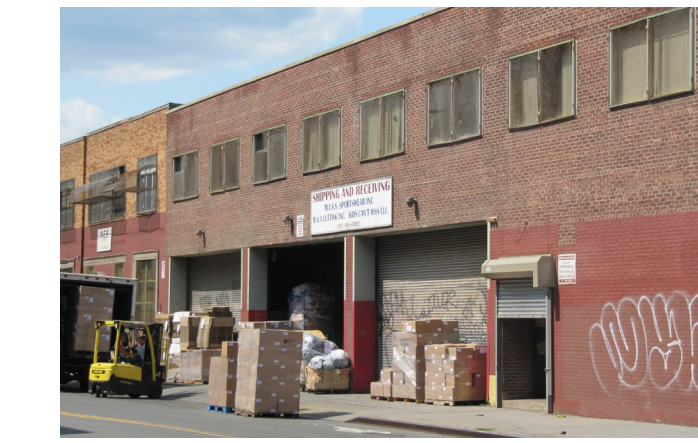
ndustrial warehouses, cement plants, scrap yards, manufacturers, vehicle storage, etc.)