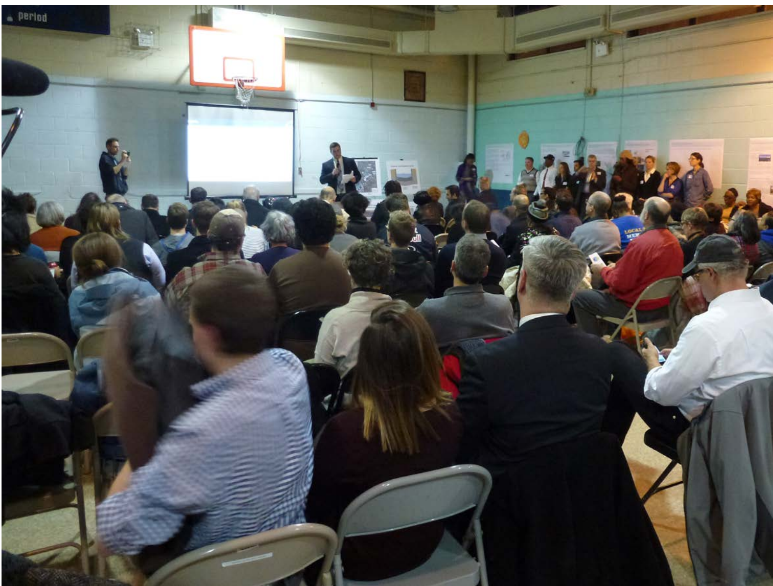
Sustainability and Resiliency Community Meeting, December 2016

Residents and businesses in Gowanus experience stormwater-related flooding of streets and basements. They recall inundation and damage from Hurricane Sandy in 2012. For years, the Gowanus community has been working toward a sustainable and resilient future, led by the efforts of a number of community-based organizations that have worked to tackle the root of many existing environmental issues, including the impacts of climate change, Urban Heat Island effect and brownfield contamination.