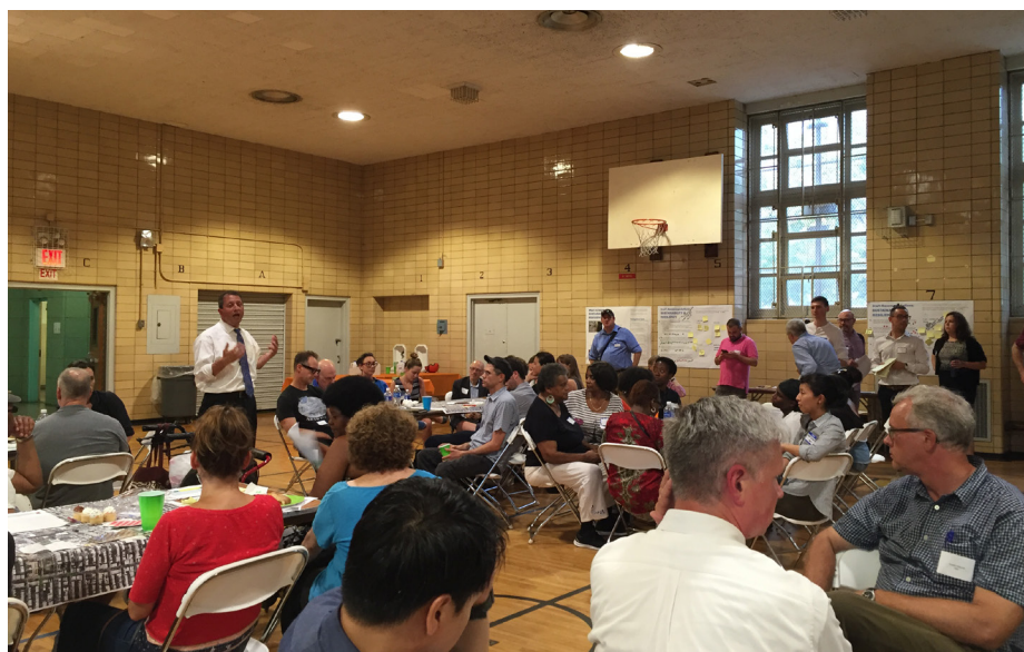
Working Group Summit, July 2017

Your involvement and engagement is critical to the success of this process. Implementation of these bold ideas will require collective action and ingenuity.