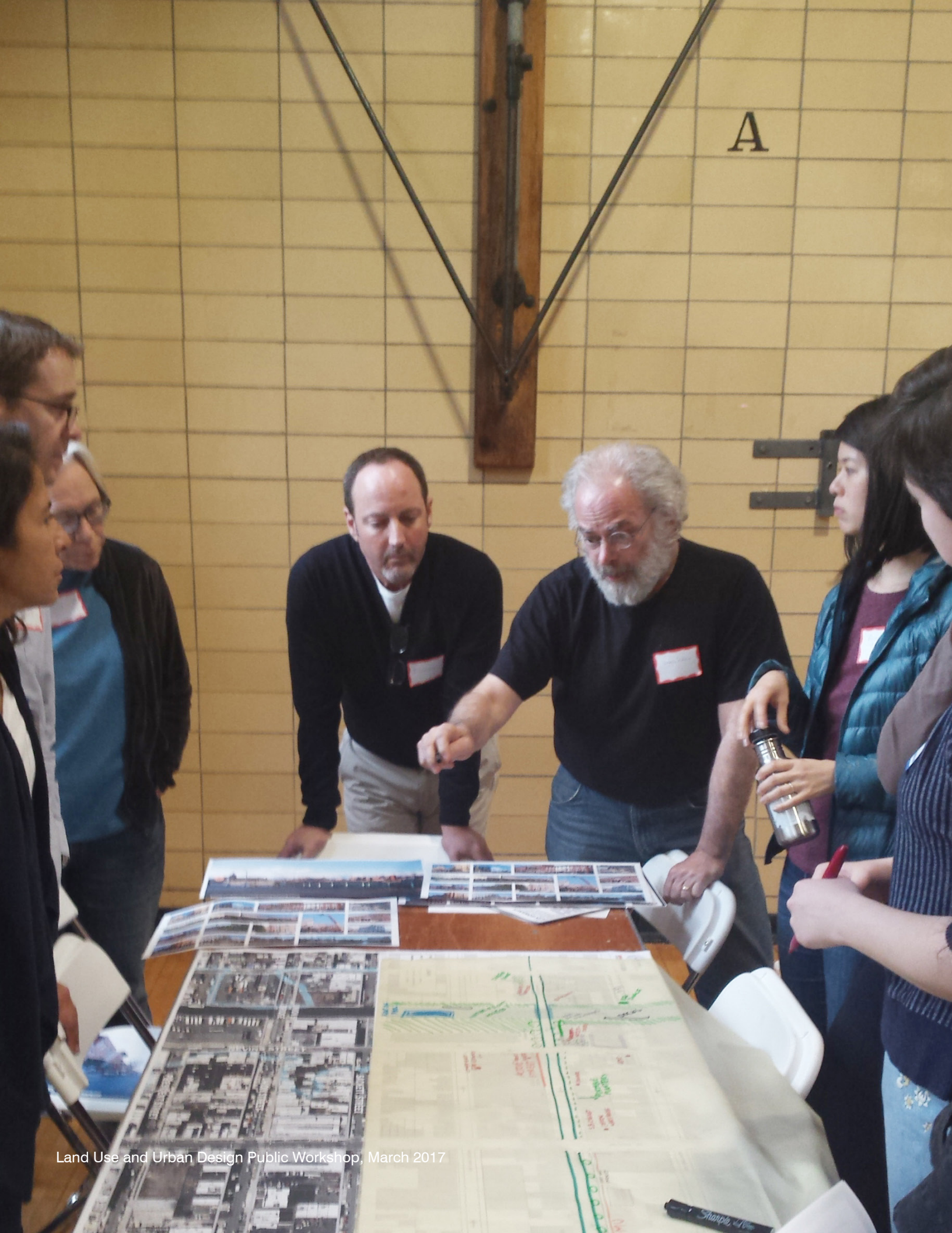
Land Use and Urban Design Public Workshop, March 2017