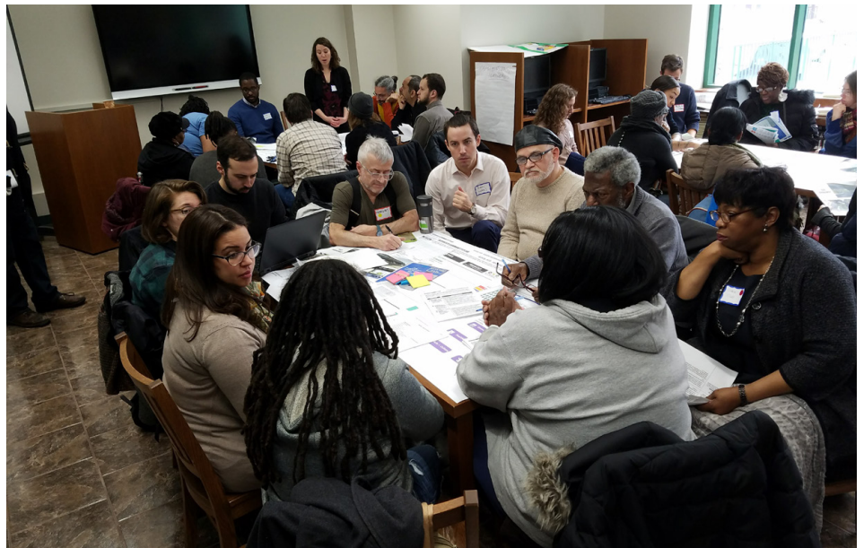
Urban Design Workshop

Thank you to all the Bushwick residents, organizations, and stakeholders who have participated in this planning process and shared their time, input, and a commitment to working towards a thriving and inclusive future for Bushwick. Your engagement is essential to the success of this process. The City looks forward to continuing the discussion about these strategies with Bushwick stakeholders.