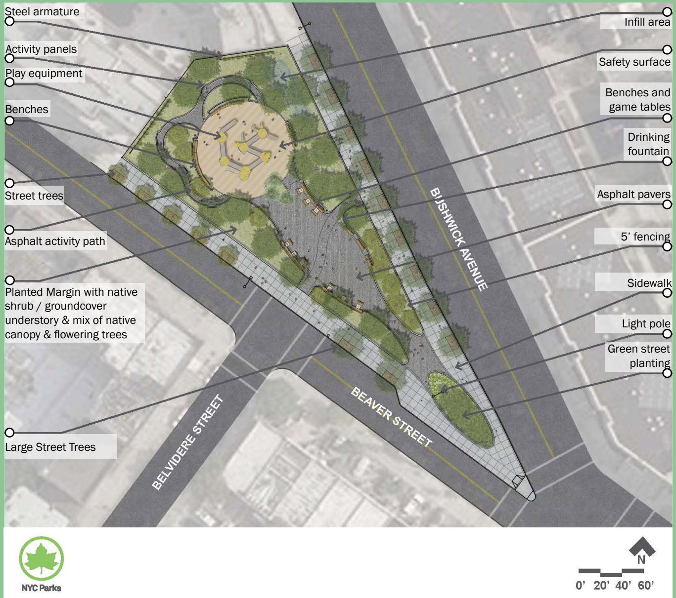
Schematic design for Beaver Noll Park, a new park on Beaver Street and Bushwick Avenue.

NYC Parks is constructing a new open space, Beaver Noll Park, at the intersection of Bushwick Avenue and Beaver Street. This project will add approximately half an acre of new open space and will feature a new seating area, play equipment, and greenery. The project is in construction and will be completed in 2019.