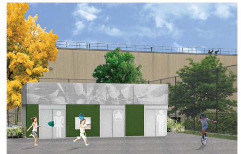
Proposed Green Central Knoll Comfort Station

New York City Department of Parks & Recreation, OneNYC