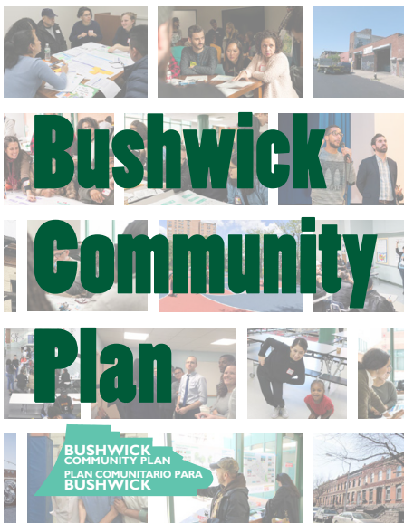
Bushwick Community Plan report

recommendations, which the Steering Committee voted on in the summer and fall of 2017, and worked to compile into a plan during 2018;