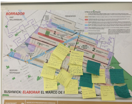
Planning framework activity