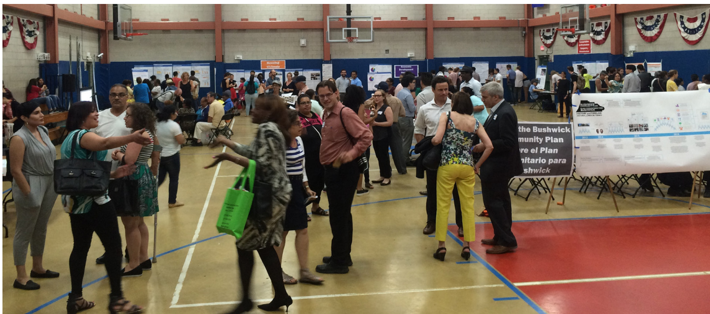
Open House, June 2016