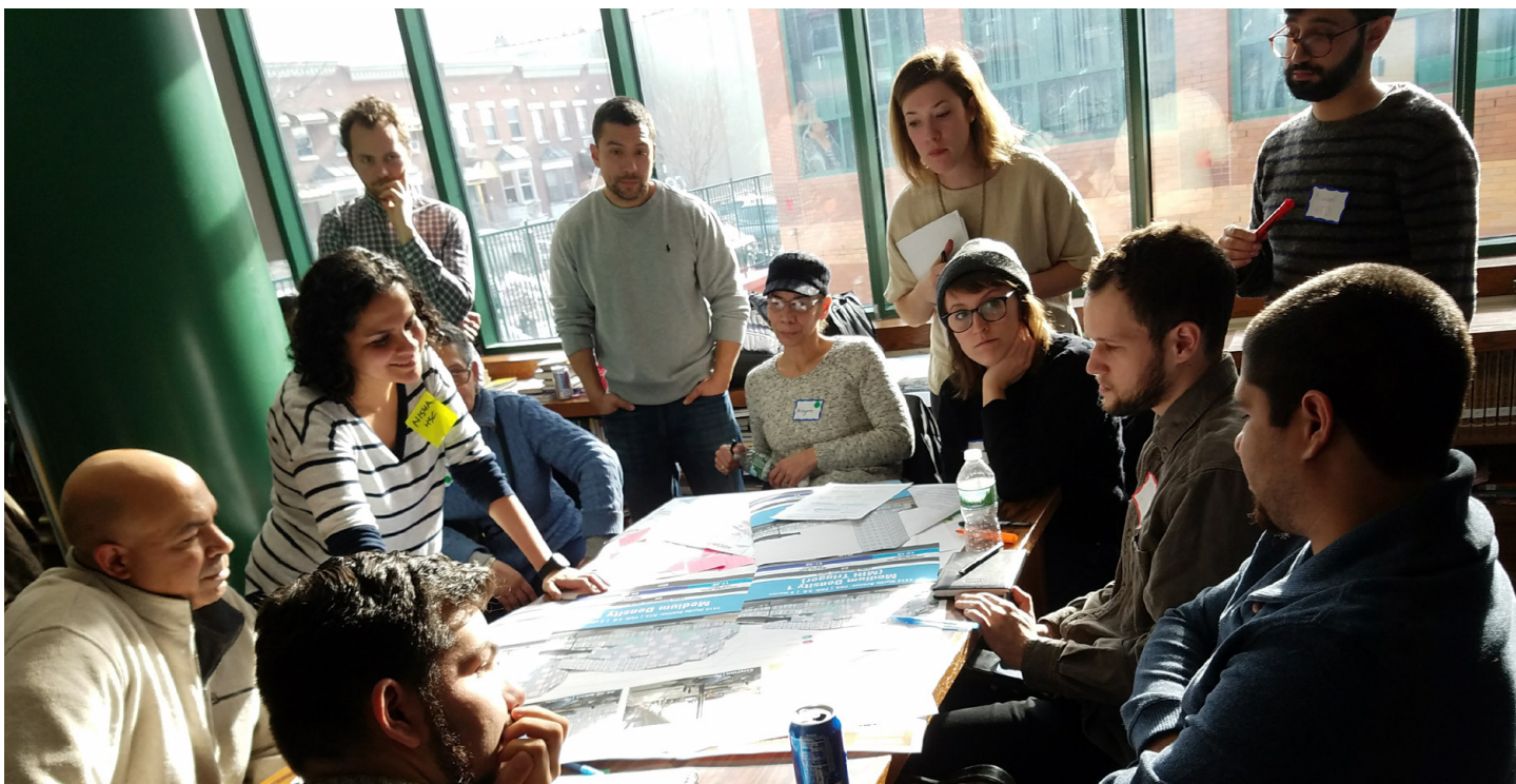
Land Use group at the Housing and Land Use Summit, February 2017

The Bushwick Neighborhood Plan Update reflects the community outreach conducted during this multi-year planning process and builds on the objectives and strategies put forward in the BCP Steering Committee's September 2018 report. The BCP and Bushwick Neighborhood Plan Update share a vision for a thriving, inclusive Bushwick and aim to achieve this through a number of overlapping and complementary strategies. While the BCP and Bushwick Neighborhood Plan Update have many shared goals and mutual alignments, they also differ on certain policy objectives. In this document, City agencies worked to prioritize the BCP strategies that could have the greatest lasting impact in the community, as well as advance new strategies to promote shared goals. The City looks forward to ongoing dialogue with community stakeholders as the planning process advances.