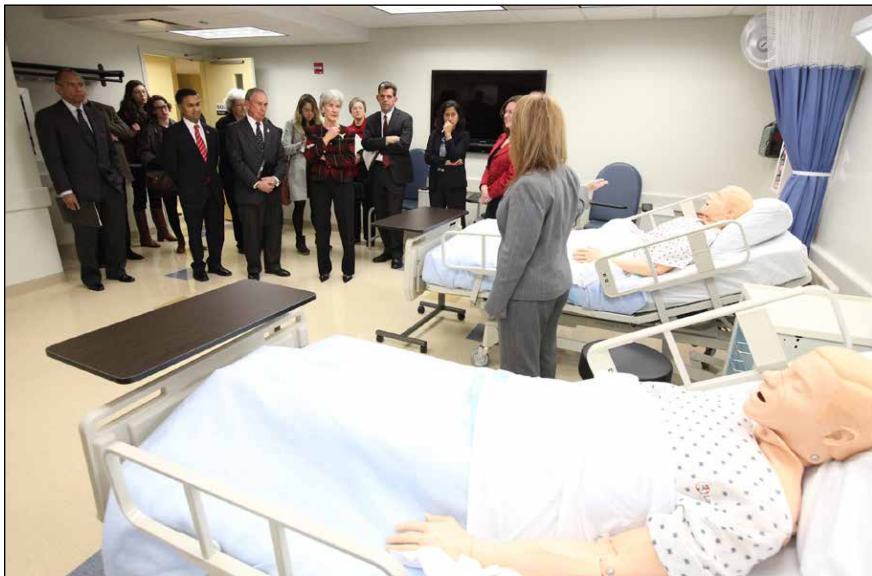
Work Force1 career centers @ nycmayorsoffice

Create a place-based talent pipeline that addresses the needs and challenges of area residents and workers, and is rooted in their interests