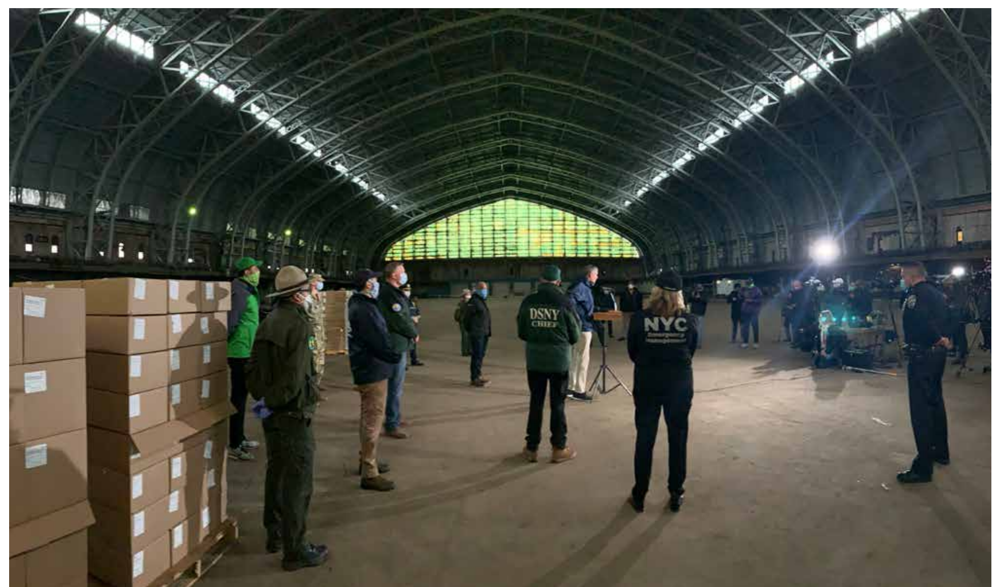
Photo: Food distribution center, Bronx