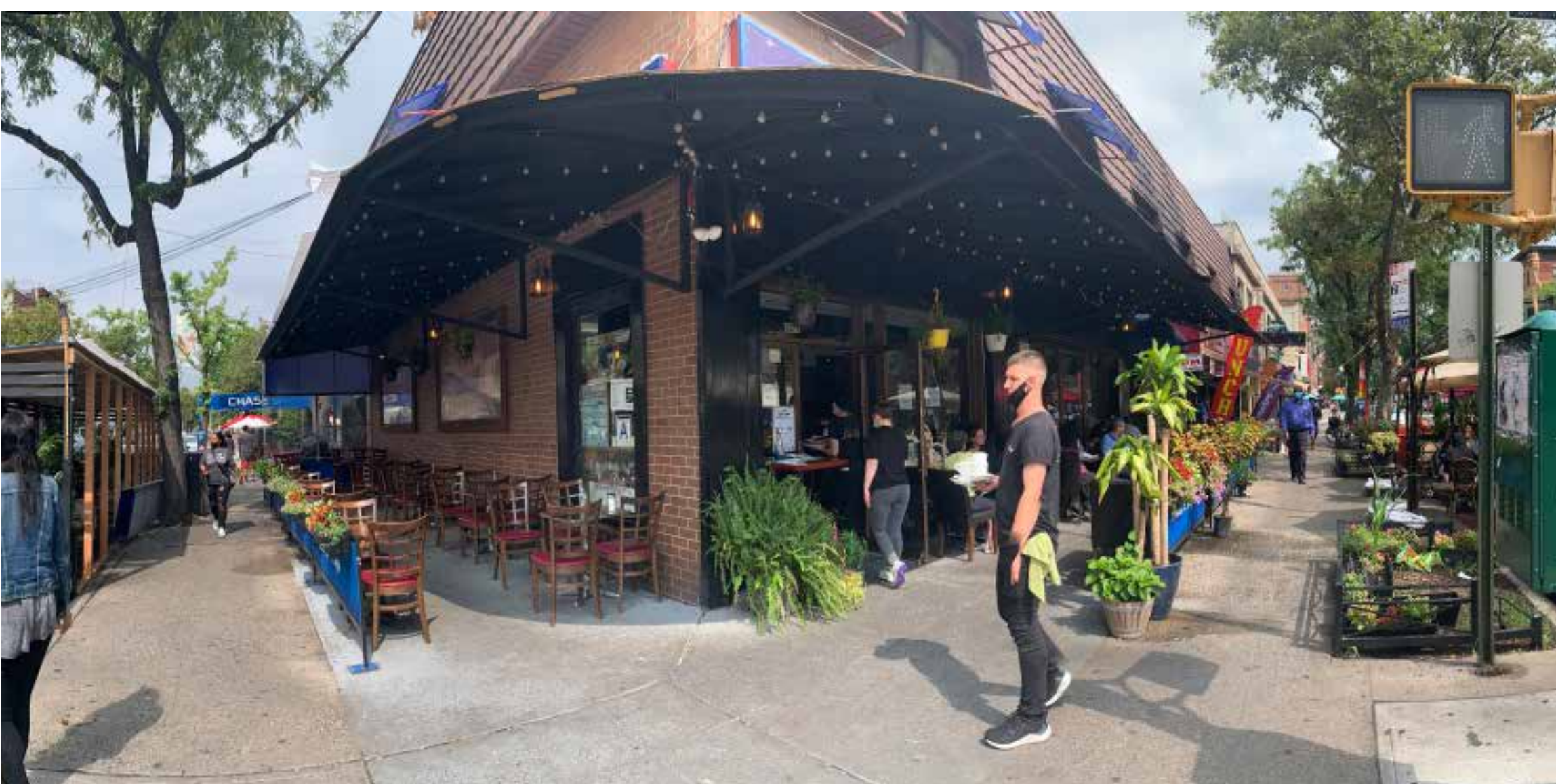
Photo: Restaurant outdoor dining, Bronx

After you have viewed the recommendations, we encourage you to join the conversation, share your priorities, and provide your own guidance as a member of the community.