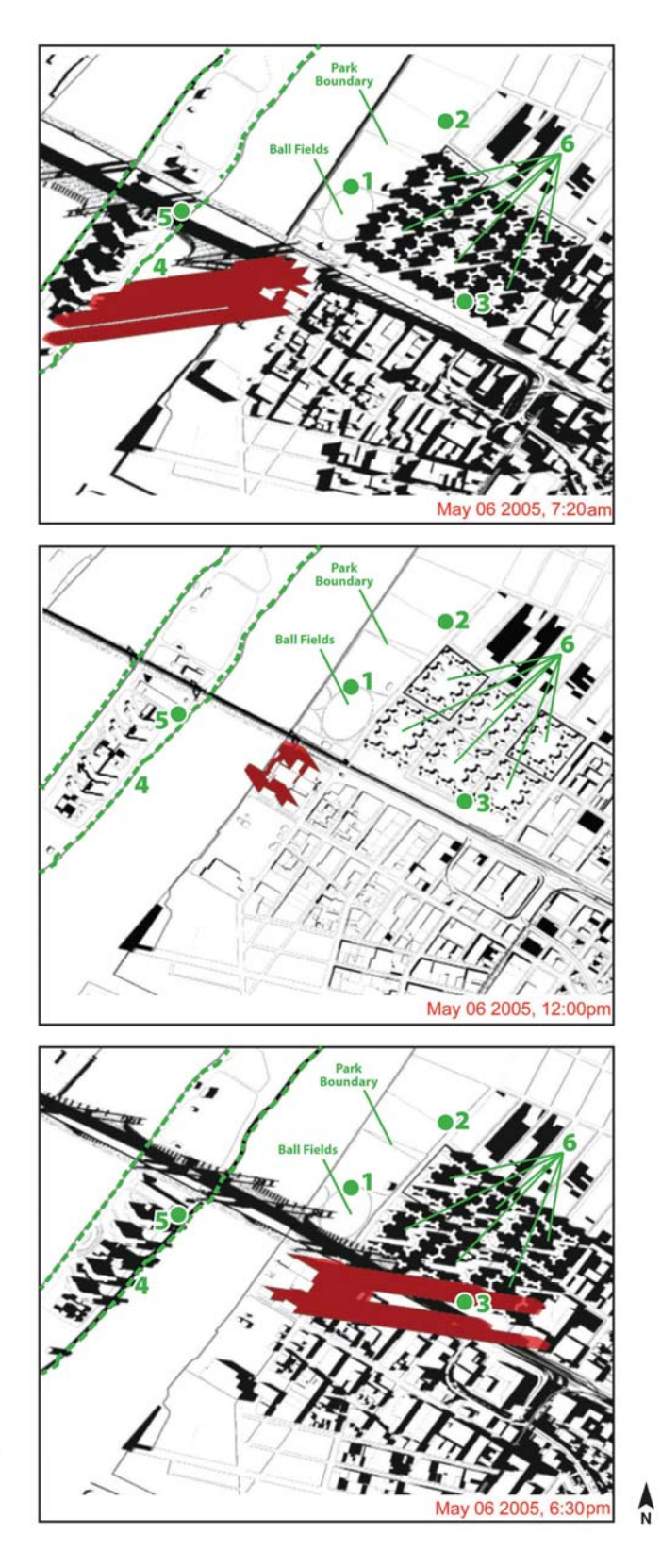
Figure 7-2: Shadows - May