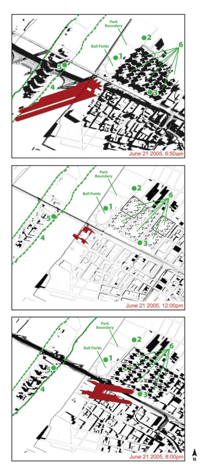
Figure 7-3: Shadows - June