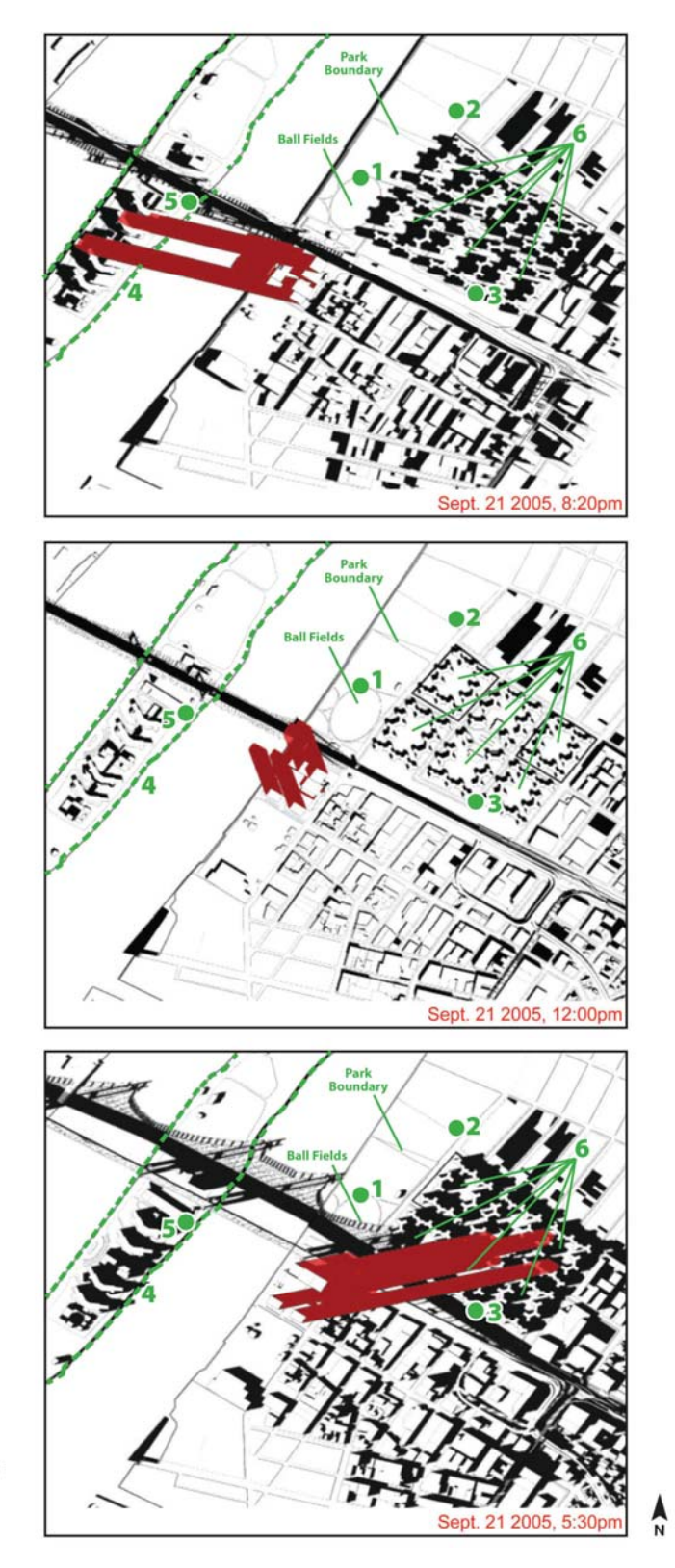
Figure 7-4: Shadows - September