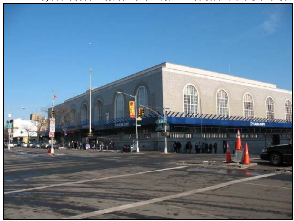
(4) View looking northeast to the former Bronx Central Annex of the United States Post Office (Resource #4), 558 Grand Concourse.

(3) View looking southeast to the Mott Avenue Control House (Resource #3) at the southwest corner of East 149th Street and the Grand Concourse.