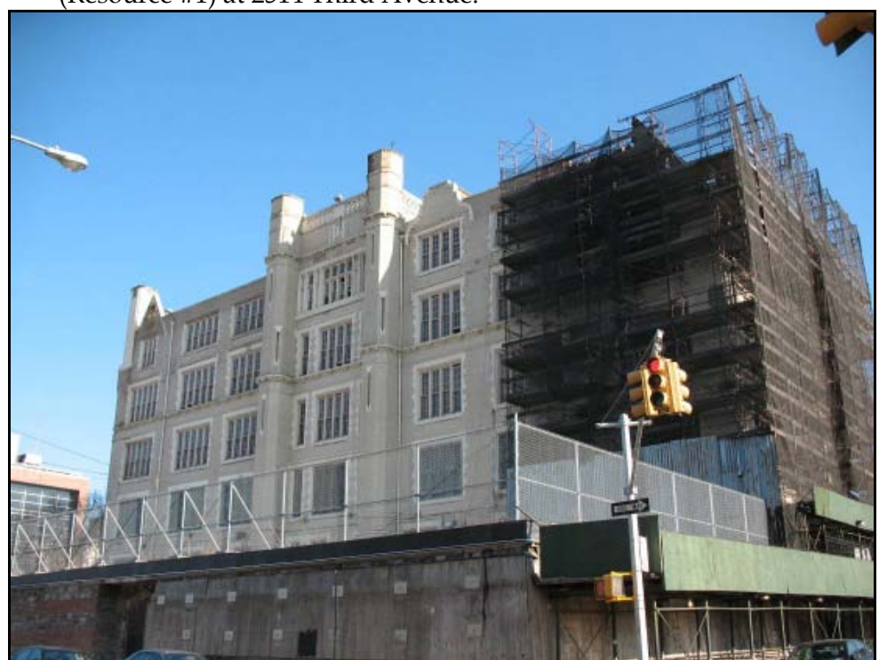
(2) View looking northeast to Public School 31 (Resource #2), 425 Grand Concourse

(1) View looking southwest to the North Side Board of Trade Building (Resource #1) at 2514 Third Avenue.