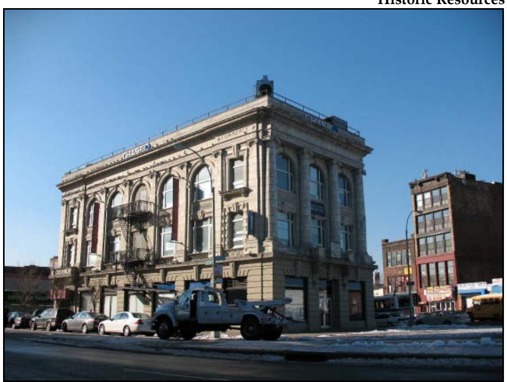
Figure 3.6-2 Historic Resources #1-#2

(1) View looking southwest to the North Side Board of Trade Building (Resource #1) at 2514 Third Avenue.