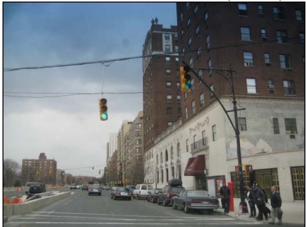
(10) View looking north from East 158th Street toward the Grand Concourse Boulevard in the Grand Concourse Historic District (Resource #10).

(9) View looking northeast along Alexander Avenue in the Mott Haven NYC Landmarks Preservation Commission Historic District (Resource #9).