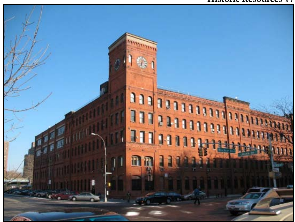
Figure 3.6-2 (Continued) Historic Resources #7-#8

(7) View looking north-northeast toward the Estey Piano Company Factory (Resource #7), 112-128 Lincoln Avenue/270-278 East 134th Street/15-19 Bruckner Boulevard.