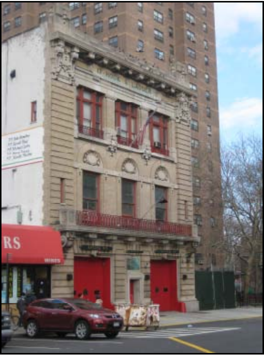
(12) View looking northeast toward the Firehook and Ladder Company 17 (Resource #12)

(11) View looking northeast toward 614 Courtland Avenue (Resource #11).