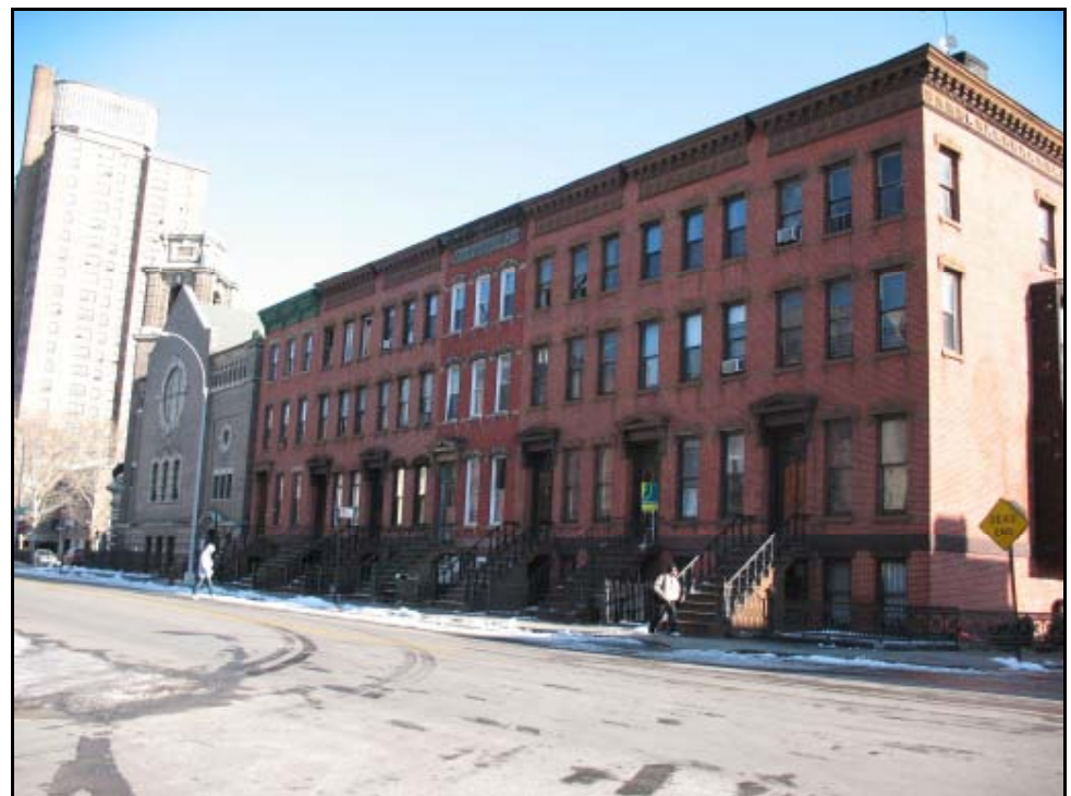
Figure 3.6-2 (Continued) Historic Resources #9-#10

(9) View looking northeast along Alexander Avenue in the Mott Haven NYC Landmarks Preservation Commission Historic District (Resource #9).