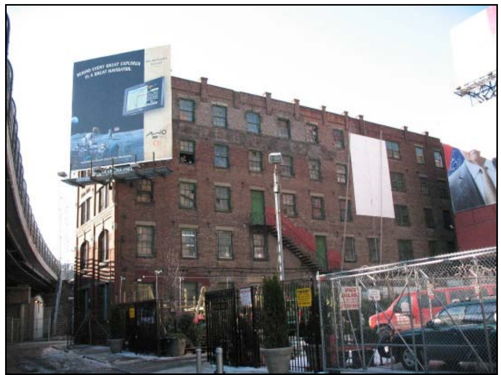
(8) View looking west-northwest toward the J. L. Mott Iron Works (Resource #8), at 220 East 134th Street.

(7) View looking north-northeast toward the Estey Piano Company Factory (Resource #7), 112-128 Lincoln Avenue/270-278 East 134th Street/15-19 Bruckner Boulevard.