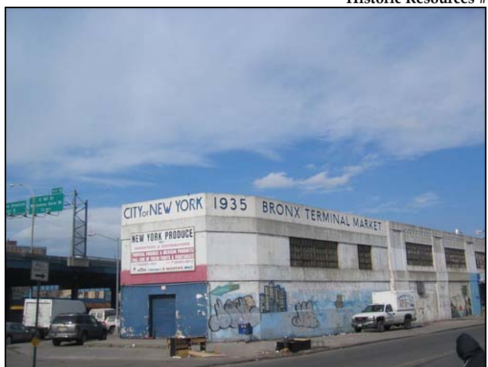
Figure 3.6-2 (Continued) Historic Resources #5-#6

(5) View looking north-northwest to Building D (Resource #5), at the intersection of River Avenue and East 149th Street, the sole surviving structure of the former Bronx Terminal Market.