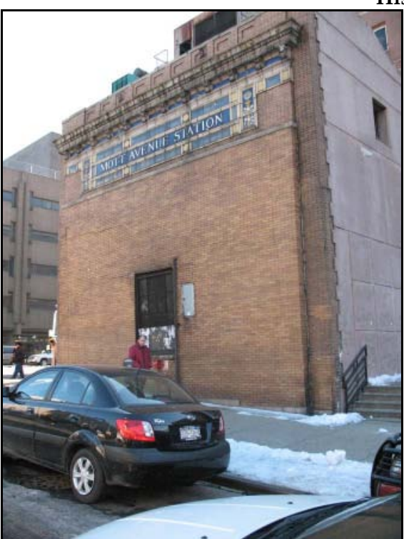
Figure 3.6-2 (Continued) Historic Resources #3-#4

(3) View looking southeast to the Mott Avenue Control House (Resource #3) at the southwest corner of East 149th Street and the Grand Concourse.