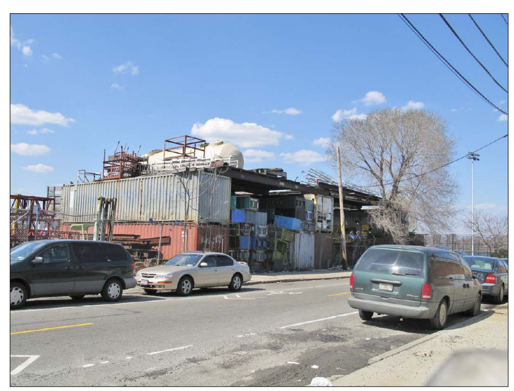
View northwest on 1st Street near 26th Avenue