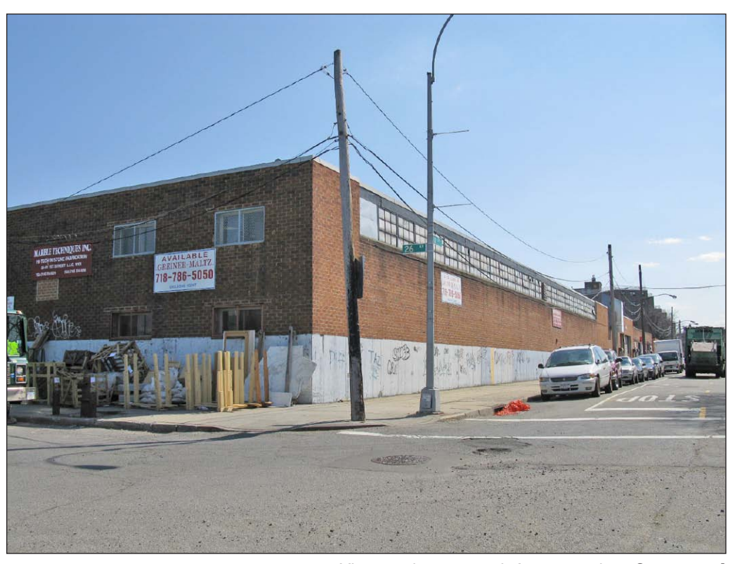
View southeast at 26th Avenue and 1st Street