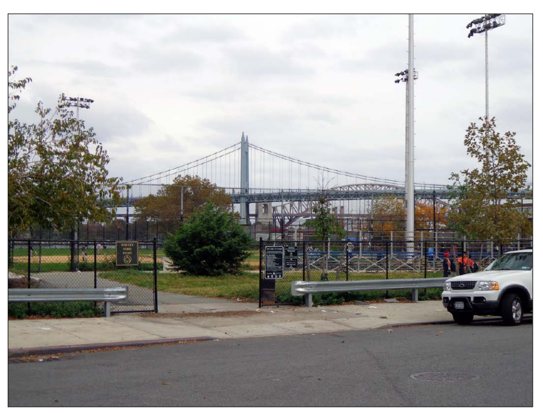
View of Whitey Ford Field from 26th Avenue