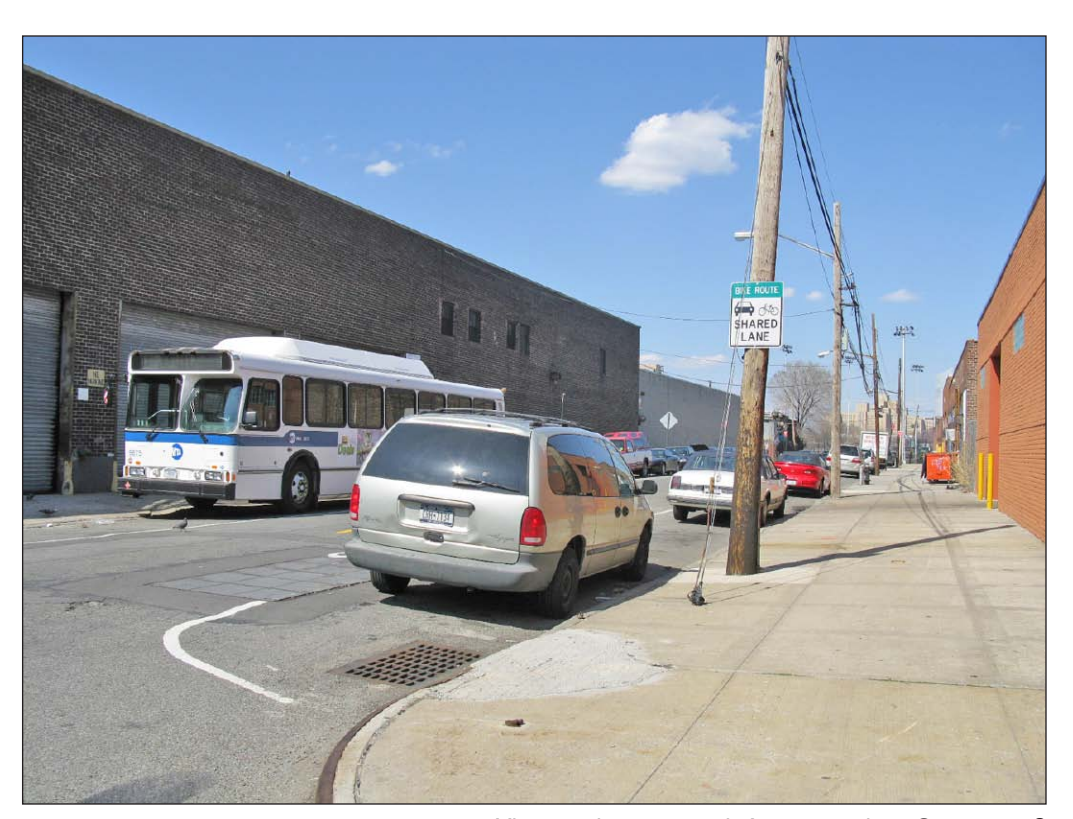
View northwest at 27th Avenue and 1st Street