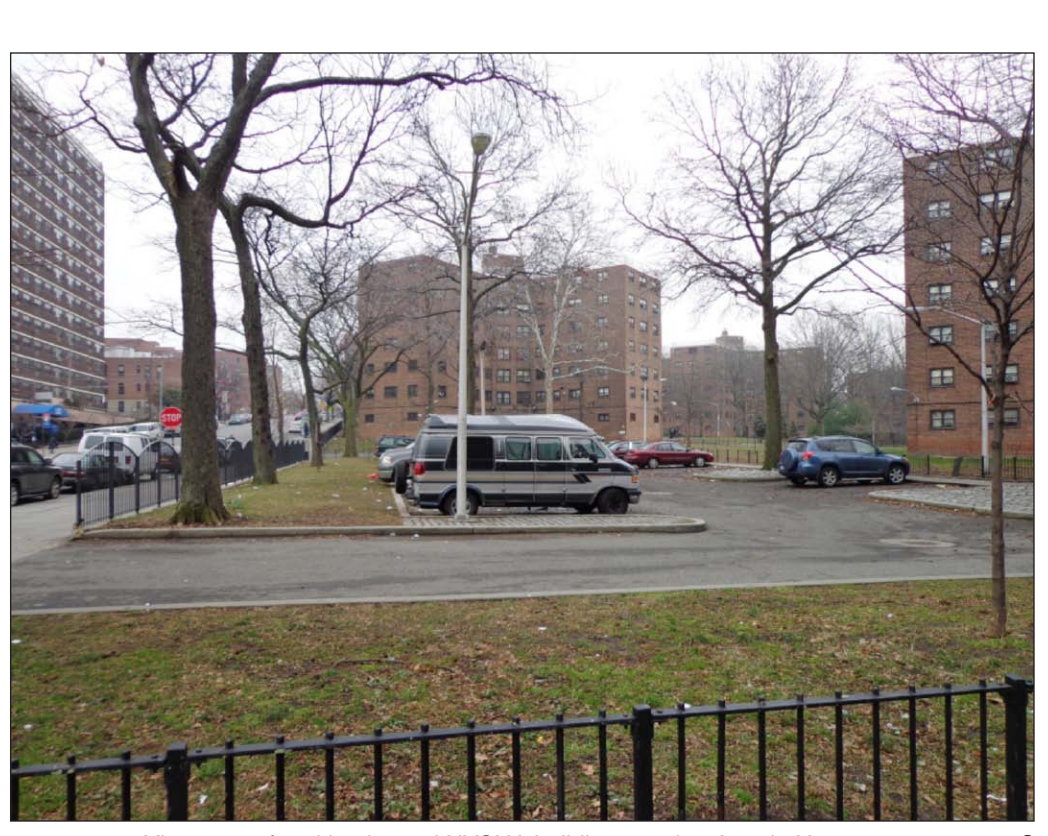
View east of parking lot and NYCHA buildings on the Astoria Houses campus