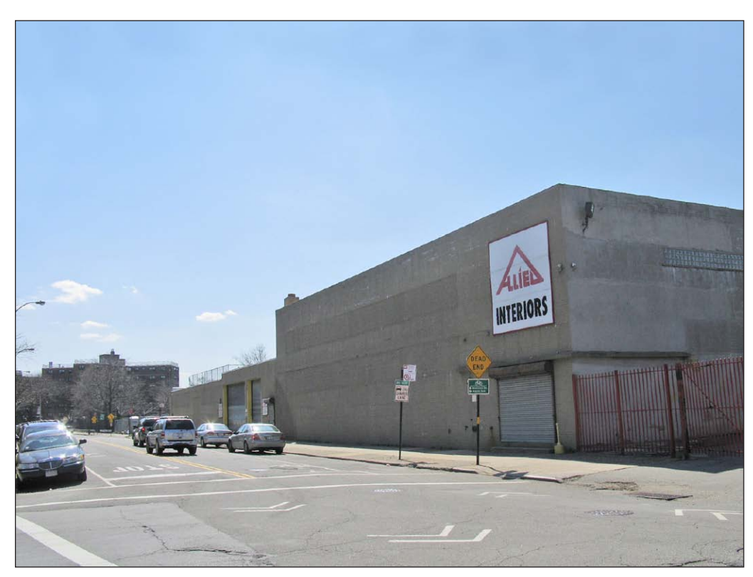
View southwest at 27th Avenue and 1st Street