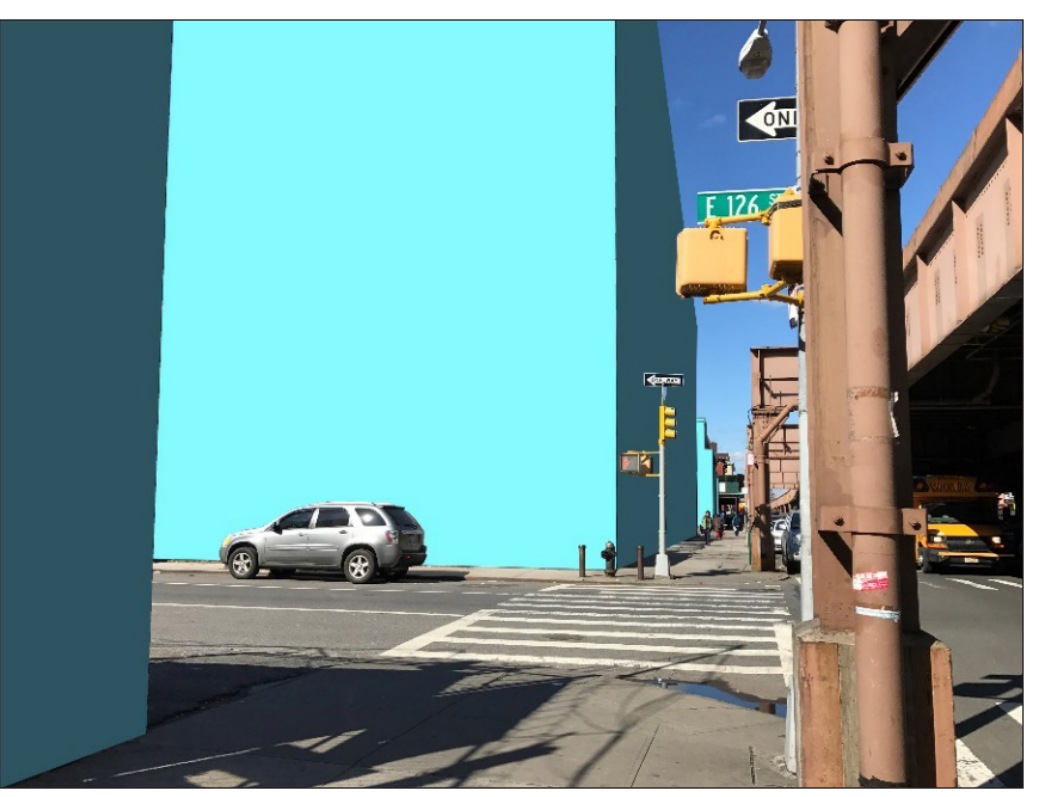
With Action Condition