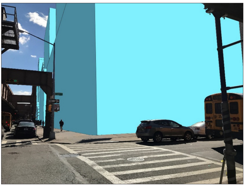
With Action Condition