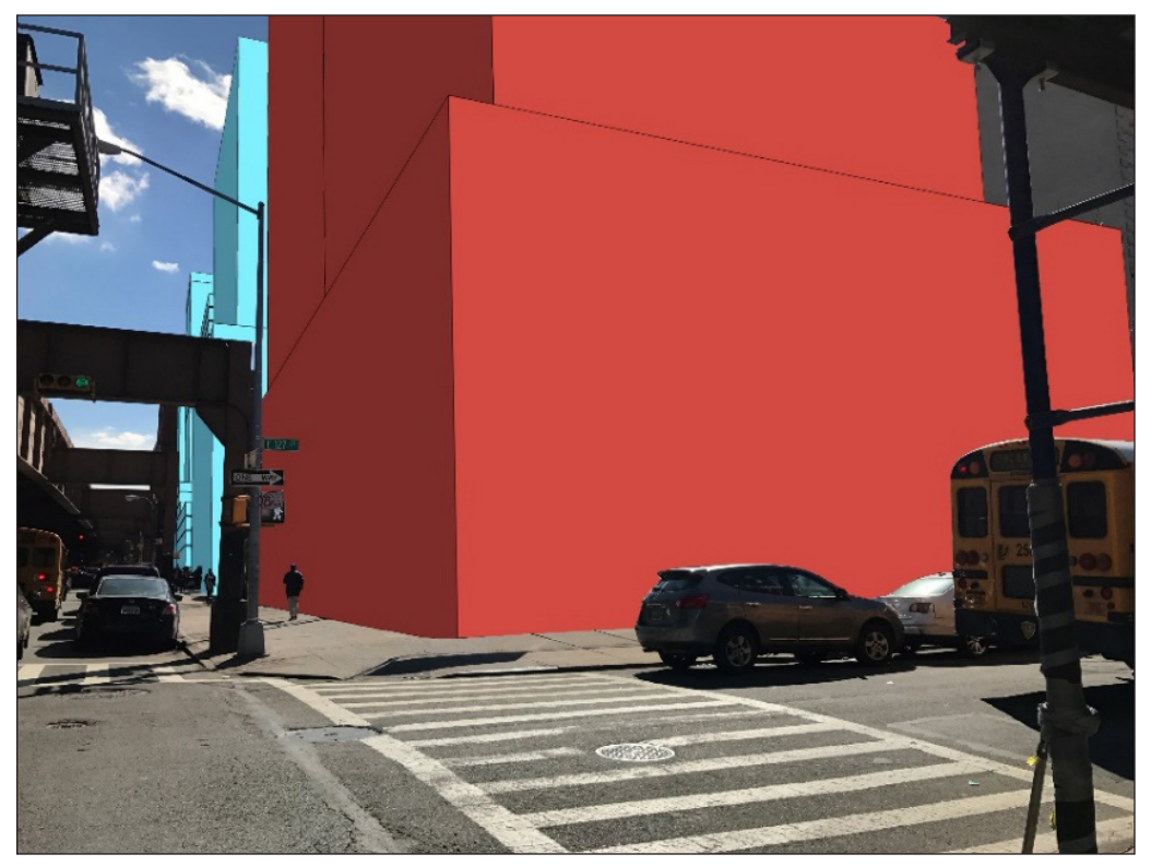
Special Permit Scenario

Comparison Massing -127th Street at Park Avenue Facing South Figure 26-3