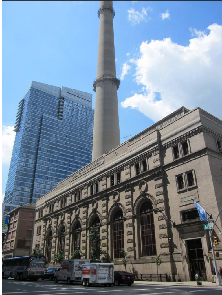
Consolidated Edison Power House 1