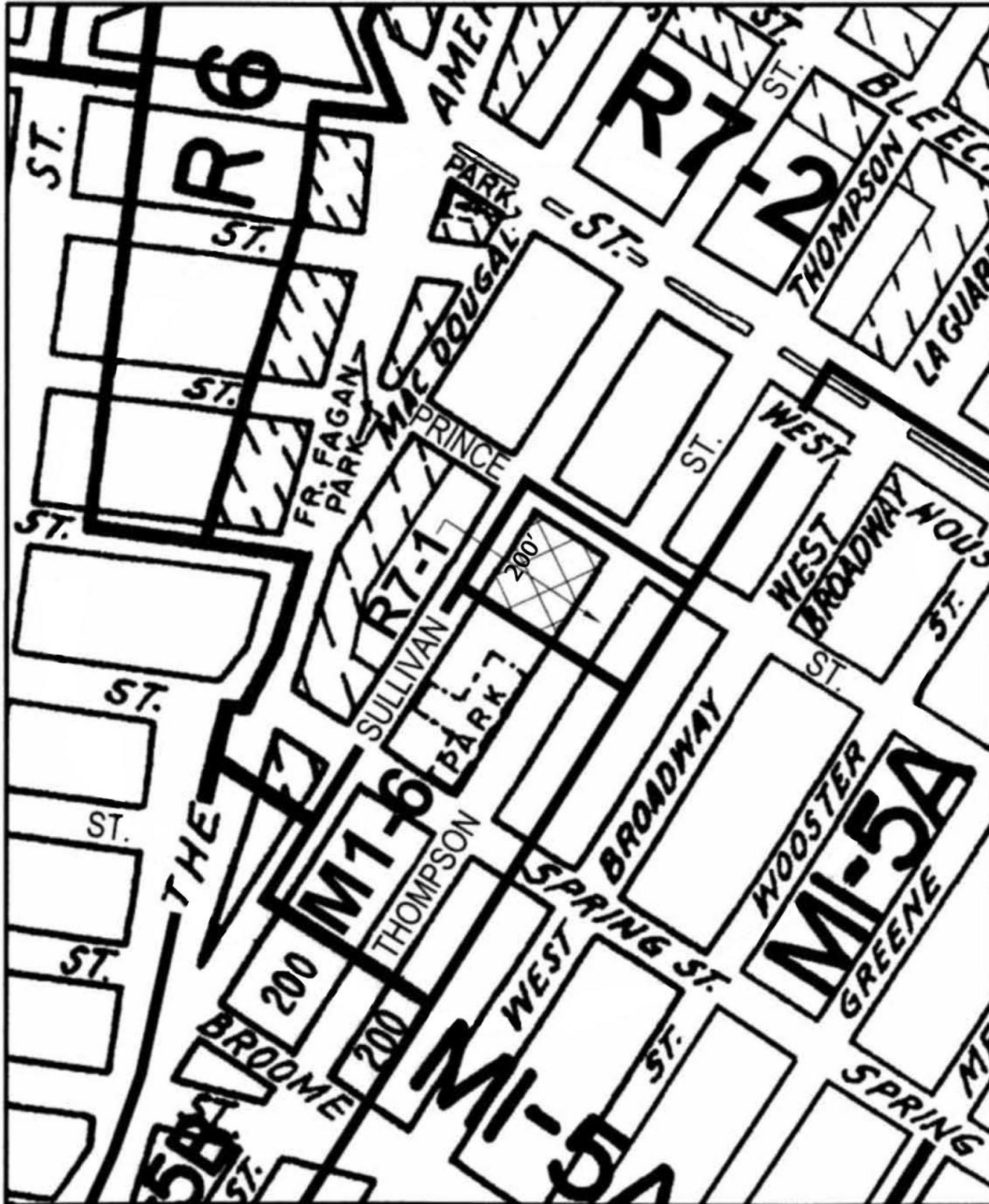
CURRENT ZONING MAP

DCP Sample: For Use as a Reference Document Only