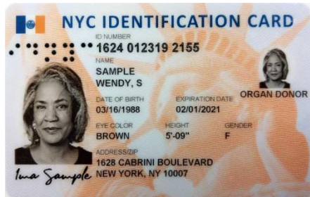
Current IDNYC card

program uses a point system whereby applicants must provide three points of identity and one point of residency. IDNYC was designed to reach a broad range of New Yorkers, with enrollment centers and pop-up sites across the five boroughs. The IDNYC card has various integrations, providing New Yorkers with access to a full range of services and programs offered by the City. IDNYC cardholders also enjoy a variety of benefits and discounts offered by businesses and cultural institutions, such as Blink Fitness, KidPass, the Metropolitan Museum of Art, Leslie-Lohman Museum of Art, and Museum of Chinese in America among others.