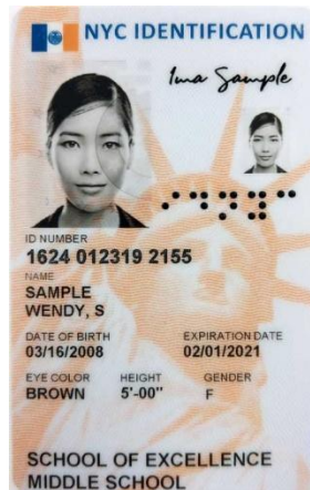
Current IDNYC Middle School card