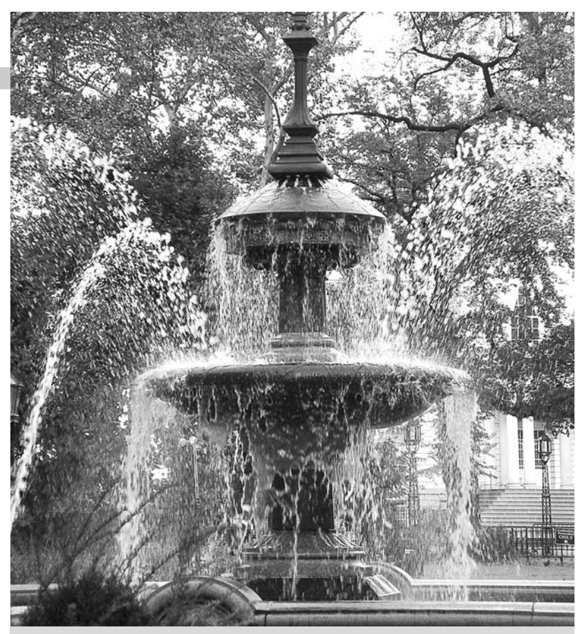
The City of New York Michael R. Bloomberg, Mayor