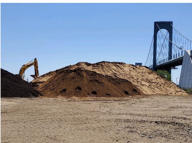
Soil used to cover a former city landfill in the Bronx