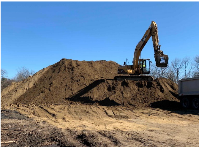
Soil delivered to the Bronx to support planting of street trees