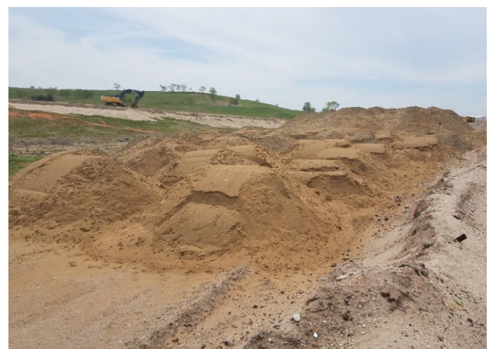
Soil used for a new park at the former Fresh Kills landfill