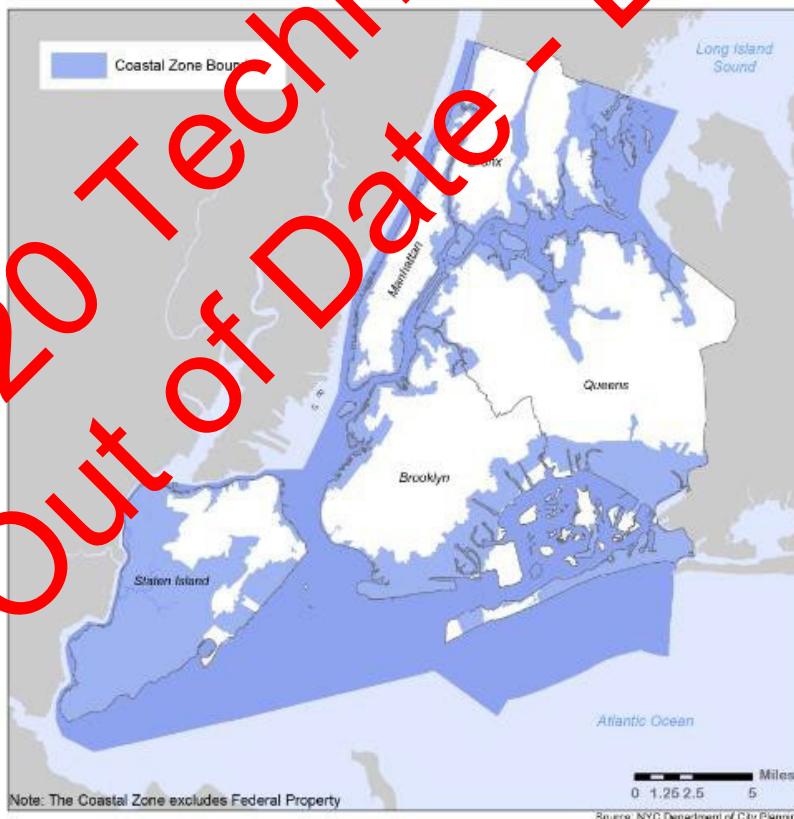
Figure 4-3 Coastal Zone Boundary

The Coastal Zone should not be confused with the "Waterfront Area" as such term is defined in Article I, Chapter 2 of the NYC Zoning Resolution or the more limited areas of "waterfront blocks" or "waterfront lots" as such terms are defined in Article VI, Chapter 2 of the NYC Zoning Resolution. Similarly, while the Coastal Zone includes the 100-Year (see definition below) and 500 Year floodplains, it is not circumscribed by any floodplain geographies.