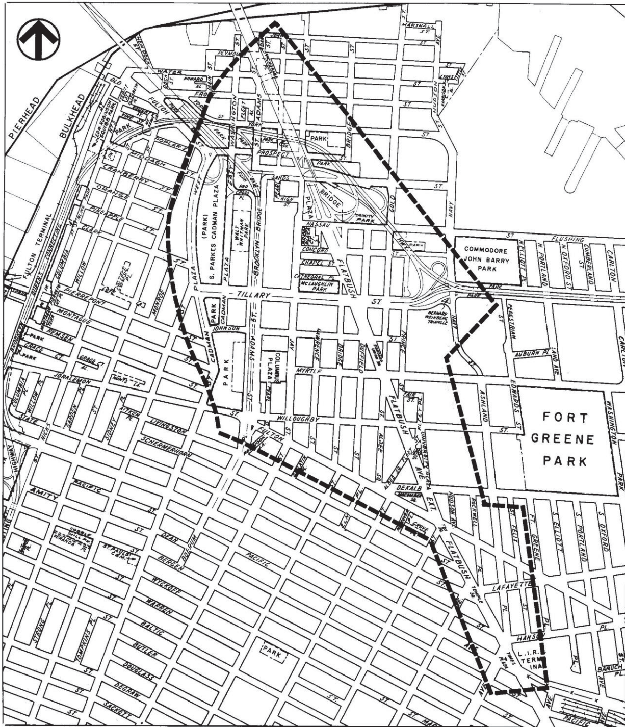
Figure 17-1 Area of Concern in Downtown Brooklyn