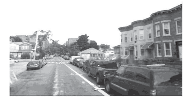
EXISTING SITE AND CONTEXT