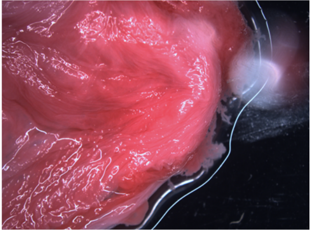
Figure 2b: Stereo-microscopic (MIDEO) image of Decidua.

7.2.4 Using light microscopy of formalin fixed, paraffin embedded, and stained tissue (Figure 3a and 3b):