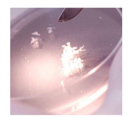
Figure 1a: CV by naked eye Figure 1b: CV by naked eye - detail