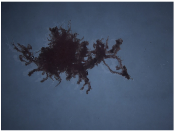
Figure 2a: Stereo-microscopic (MIDEO) image of chorionic villi.

7.2.3 Using stereo-microscopy (Figure 2a and 2b):