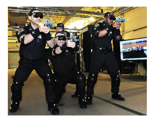
USING MOTION-CAPTURE TECHNOLOGY, OFFICERS ENGAGE IN ACTIVE-SHOOTER TRAINING THAT CAN BE COMPUTERIZED AND ANALYZED TO DISTILL BEST PRACTICES.

Additionally, the NYPD's new Office of Collaborative Policing helped design the Department's Crisis Intervention Team (CIT) training. CIT teaches cops about how to approach and gain voluntary compliance from emotionally distressed people and substance abusers. It is scheduled to be given to 5,500 police officers in the next year.