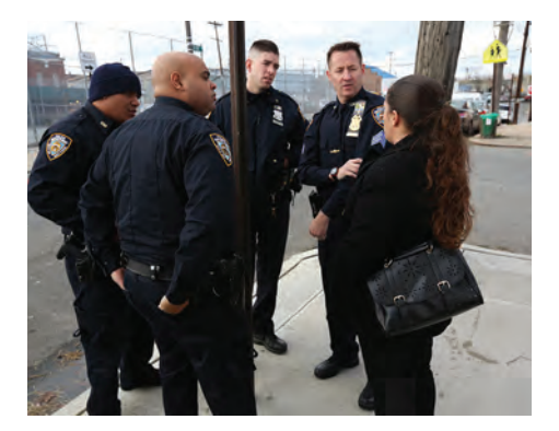
BY MAKING THE PUBLIC AN ACTIVE PART OF PUBLIC SAFETY, NEIGHBORHOOD POLICING RECOGNIZES THAT FIGHTING CRIME AND BUILDING TRUST HAVE TO BE PURSUED IN TANDEM.

Bringing it all together is CompStat, the NYPD's command accountability system, which continues to be instrumental in driving down overall index crime. Each week, a different borough command comes to police headquarters for intensive analysis and strategy sessions that cover everything from increases in shootings and violence, to rises in robberies and property crime, to the pursuit of wanted felons, to the investigation of outstanding cases of all kinds. Supported by electronic mapping and other data-display technology, the CompStat sessions are the central forum for ensuring that NYPD resources are used with precision—that is, they're focused on the problems that matter most and the crimes that pose the greatest danger.