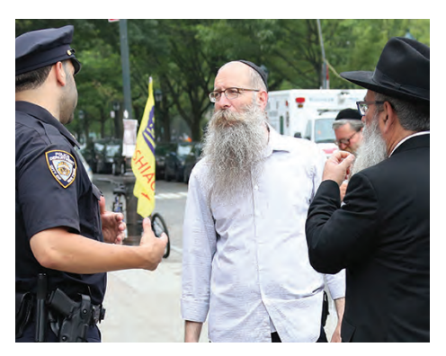
BY WORKING WITH COMMUNITY MEMBERS MORE CLOSELY AND COMPLETELY THAN EVER BEFORE, THE NYPD REINFORCES ITS COMMITMENT TO FINDING COMMON GROUND ON LOCAL GROUND.

All of these efforts are part of reinforcing the trust spoken of by Sir Robert Peel: "The power of the police to fulfill their functions and duties is dependent on public approval of their existence, actions, and behavior, and on their ability to secure and maintain public respect."