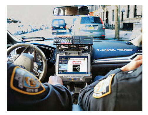
PUTTING A TABLET IN NEARLY EVERY CAR ALLOWS PATROL OFFICERS TO PERFORM ADMINISTRATIVE TASKS IN THE FIELD, RATHER THAN REQUIRING A TRIP TO THE STATIONHOUSE.

As of January 2016, the Department's Automatic Vehicle Locator system is up and running in more than 5,000 vehicles, providing enormous advantages in managing patrol and ensuring officer safety. ITB is also managing ShotSpotter technology that can identify and report gunshots, and body-camera technology that can record enforcement encounters between police and the public. The list goes on: video-teleconferencing systems, crime-pattern-recognition software, and a digital detail-management system. There is also an enterprise-training platform that can produce course catalogues, schedules, and transcripts, and also host training videos, providing more training instruction to more people on their own schedules. Many of these will rest on the new NYPD Intranet, or internal website, which is being rebuilt with a SharePoint system to provide NYPD personnel with easy access to applications and information in a welcoming and navigable digital environment.