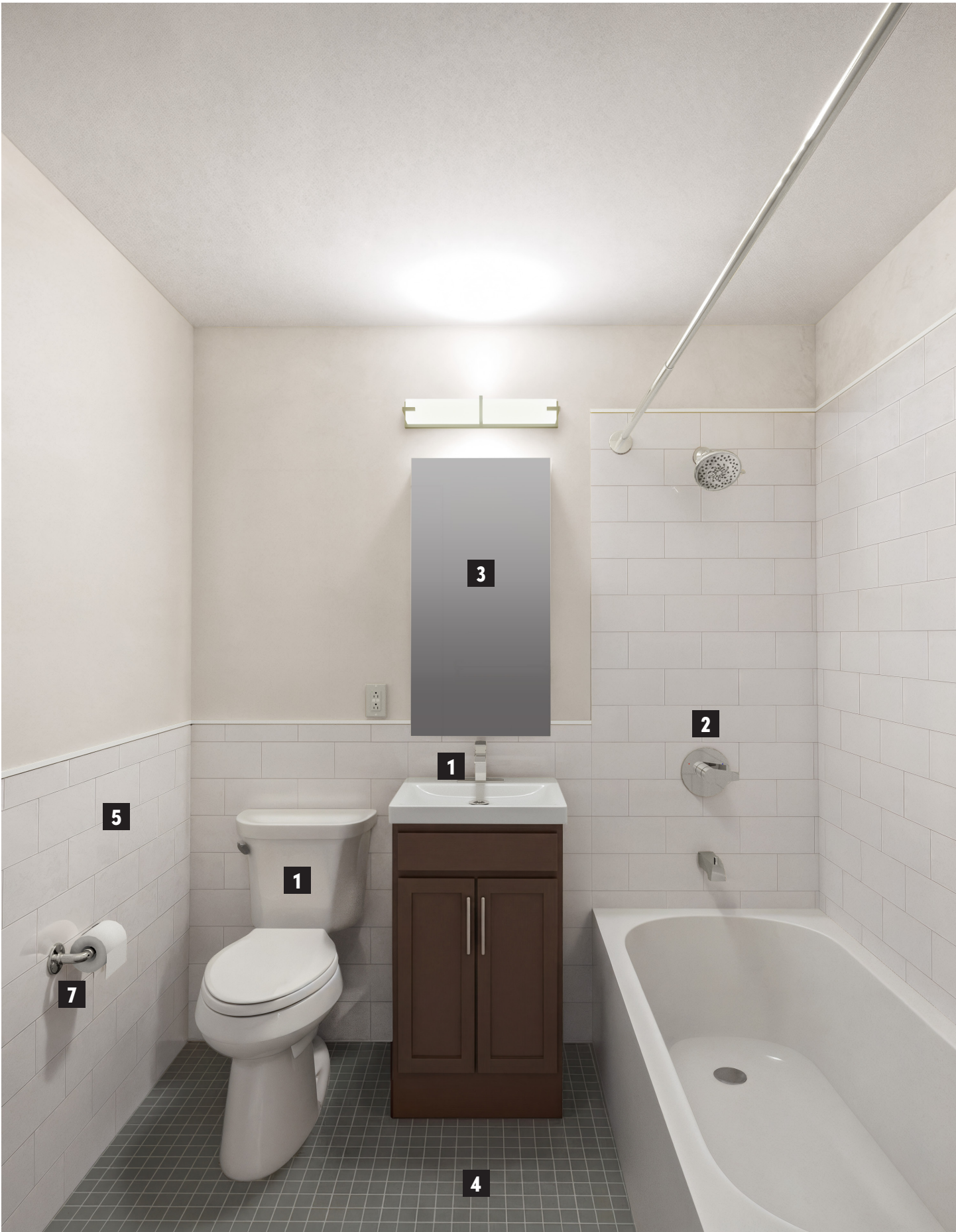
Rendering of renovated bathroom - renderings are illustrative of finishes, not layouts