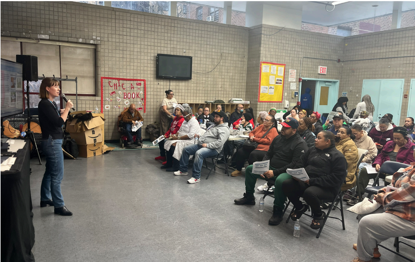
Moore Houses Resident Meeting