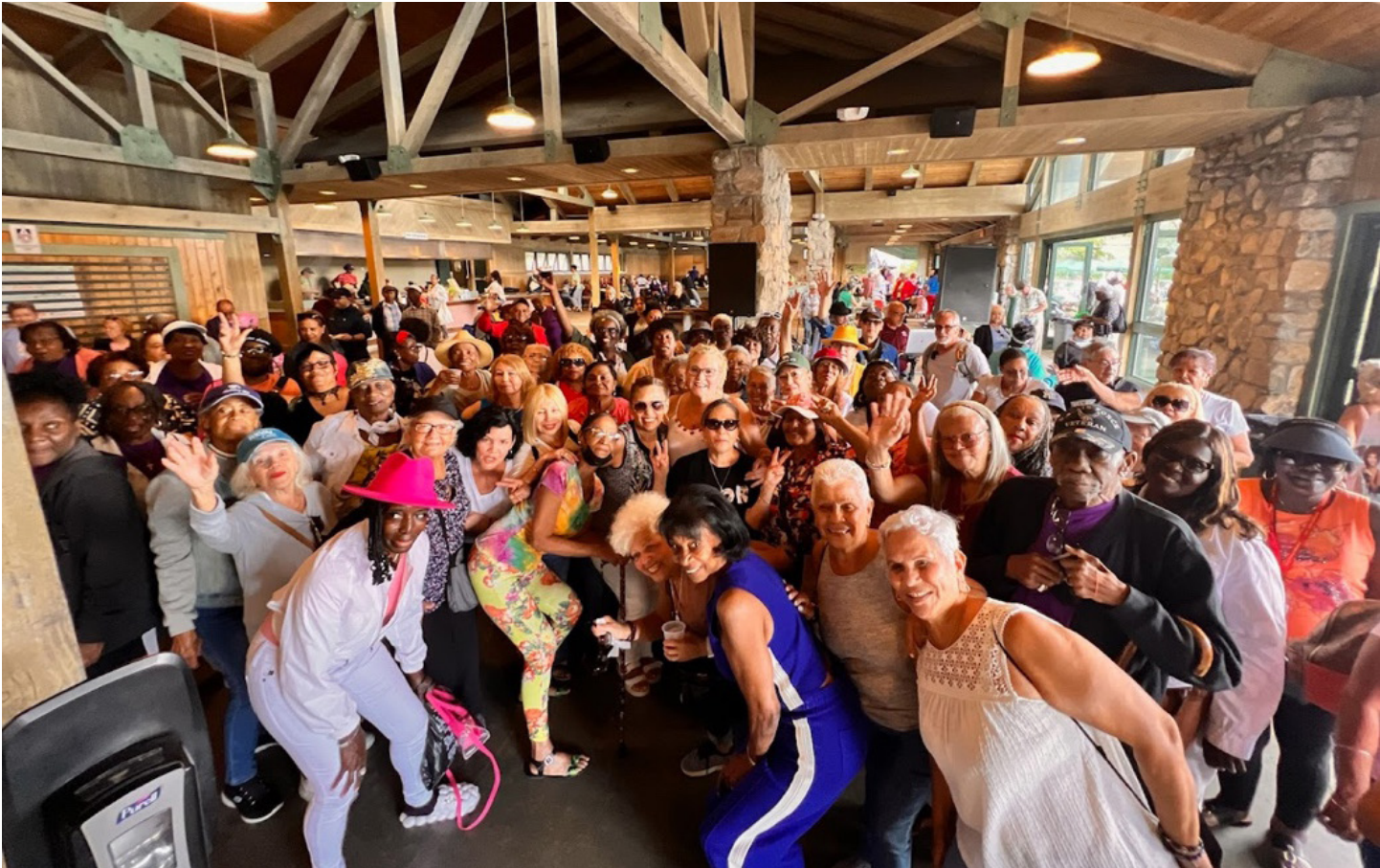
Moore Houses and East 152nd St-Courtlandt Ave Social Services