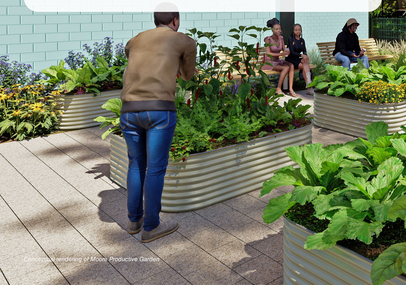
Conceptual rendering of Moore Productive Garden

NYCHA and the selected PACT partners – Mega Group Development and Brisa Builders Development – have worked closely with residents to design every aspect of the Moore Houses and East 152nd Street-Courtlandt Avenue transformation. After extensive resident engagement, the plans for the large-scale renovation and ongoing property management have been completed and are described in this document.