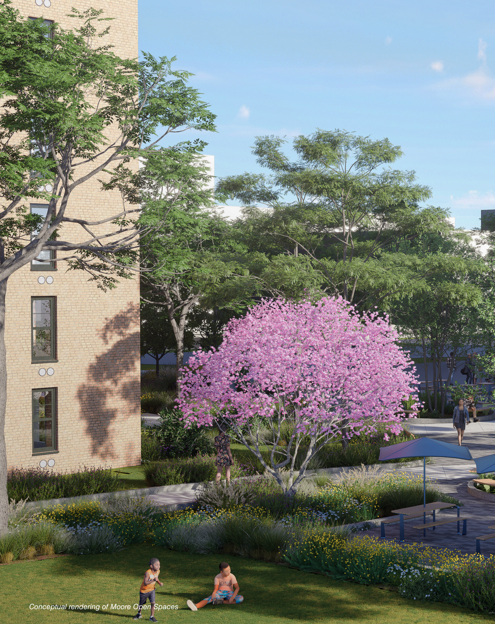
Conceptual rendering of Moore Open Spaces