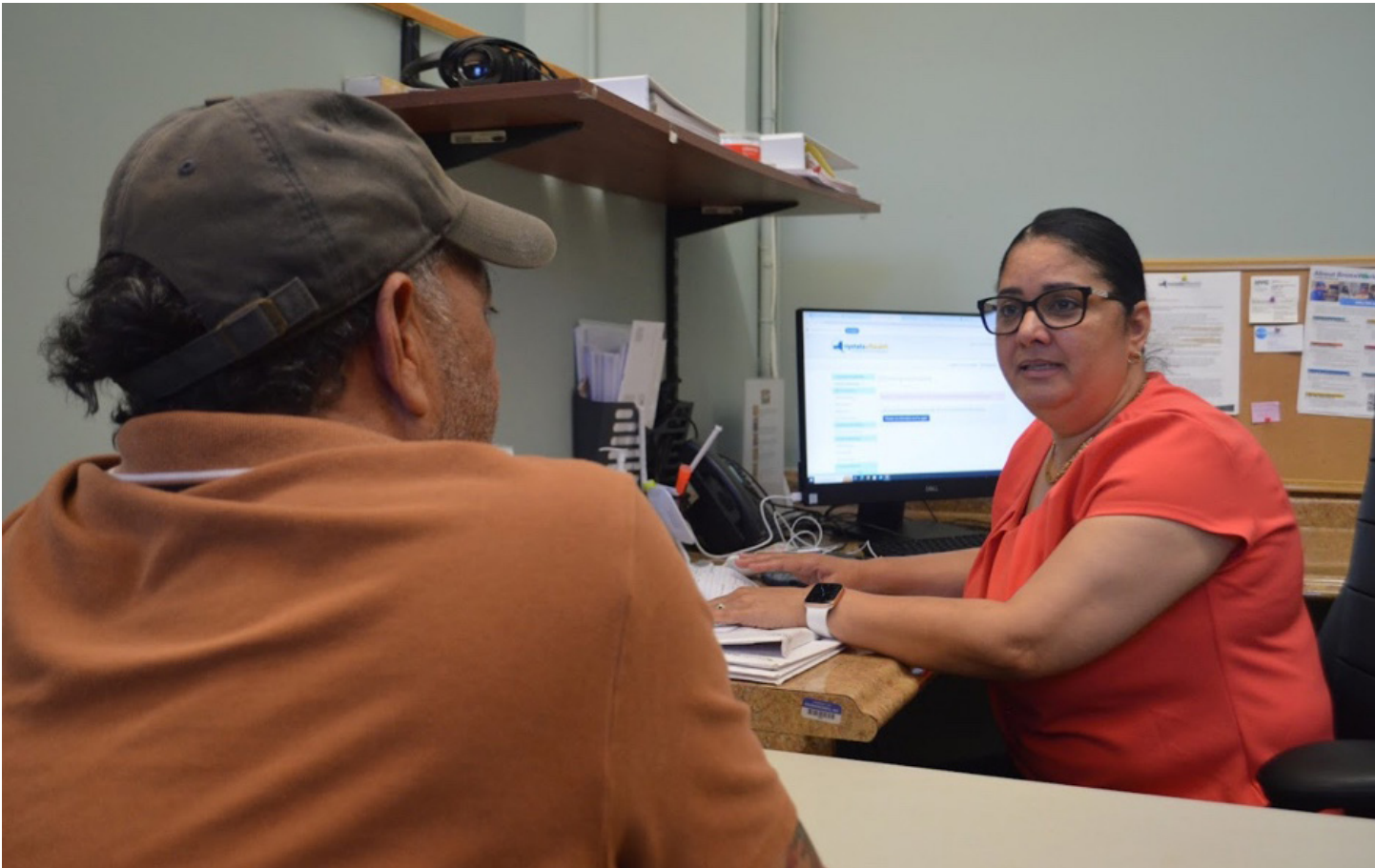
Moore Houses and East 152nd St-Courtlandt Ave Social Services