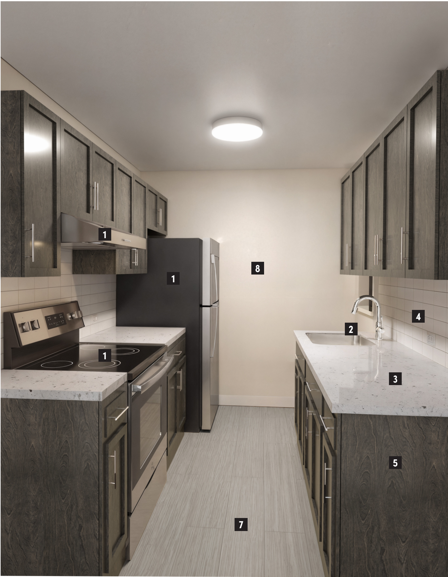
Rendering of renovated kitchen - renderings are illustrative of finishes, not layouts