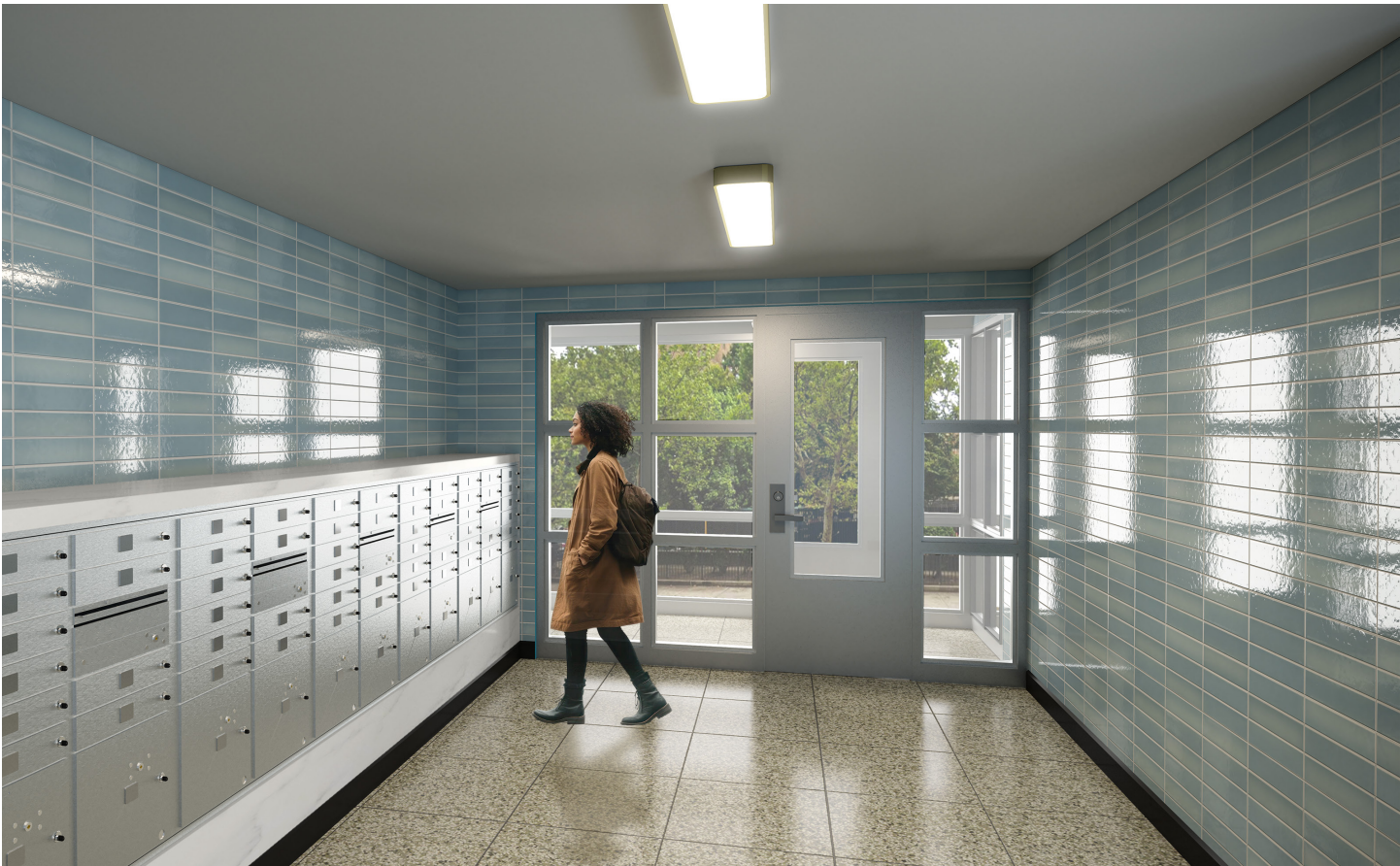
Conceptual rendering of Moore Lobby