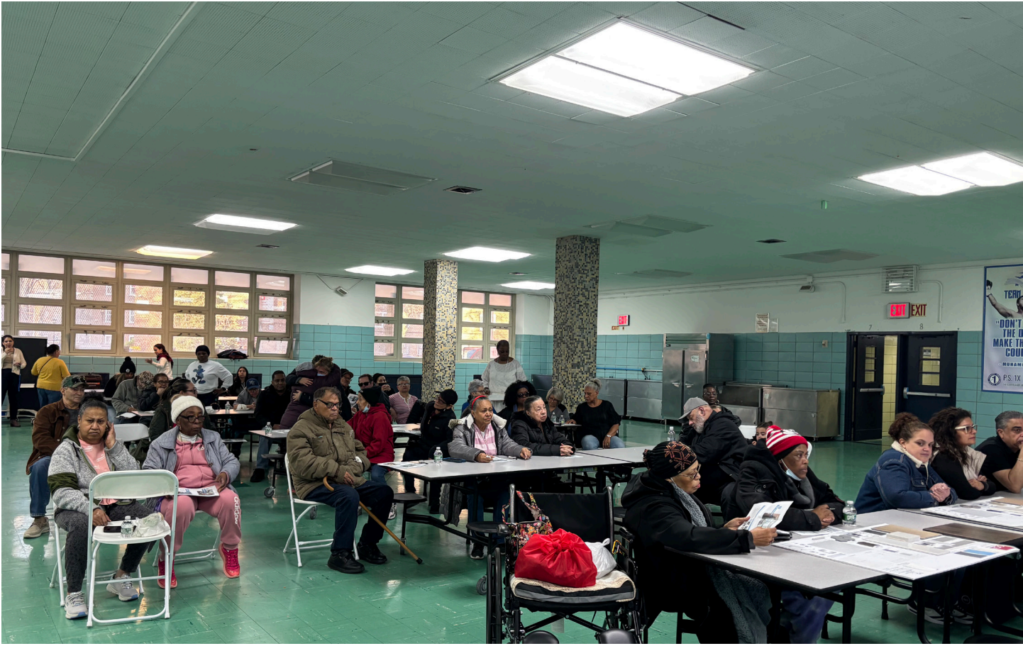
East 152nd Street-Courtlandt Ave Resident Meeting