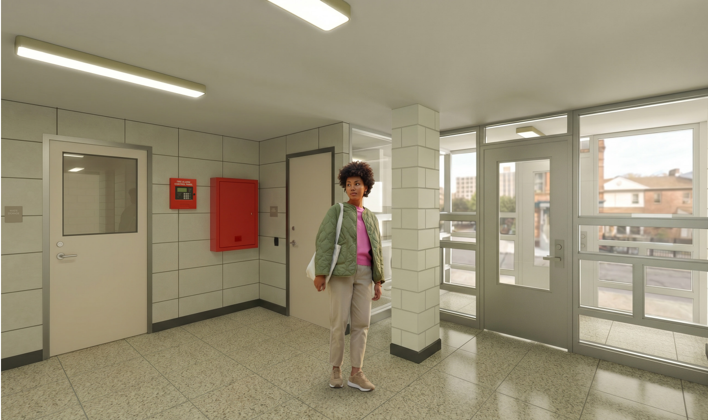
Conceptual rendering of Courtlandt Lobby