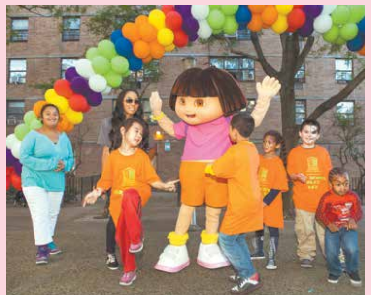
NYCHA youth hang out with Dora the Explorer as part of Nickelodeon's 10th Annual Worldwide Day of Play at Campos Plaza on September 18, 2013.