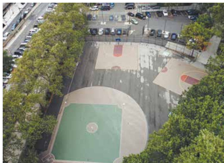
One of the proposed locations for new construction as part of NYCHA’s Land Lease plan is this recreational field at Smith Houses.