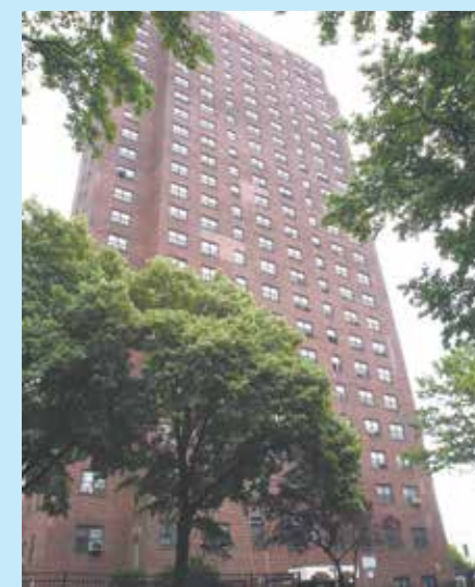
Kingsborough Extension is one of the first developments that will have repairs done with the $732 million in funding obtained by NYCHA through a new bond issuance.

All of this work on behalf of NYCHA families reaffirms NYCHA's core promise of providing safe, affordable housing in a state of good repair. It also continues our commitment to maintain and preserve public housing in New York City, while many other public housing authorities across the country are demolishing their buildings. Over the past three years, NYCHA has made approximately $1.5 billion in capital investments, including $423 million in federal stimulus funding for capital improvements that enhanced