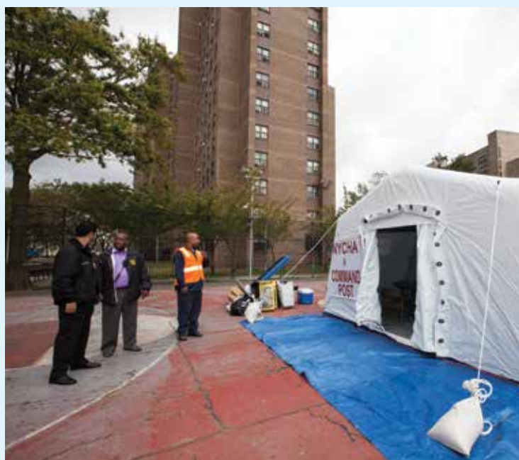
One of the new portable tents NYCHA purchased that can serve as mobile command posts during emergencies at developments is used during a drill at Coney Island I Houses (Site 1B).

After Hurricane Sandy, NYCHA conducted extensive analysis to determine best practices for preparations and responses. One of the recommendations recently put in place was the purchase of portable and inflatable tents that can be set up at any location. The tents – which come with lighting, a portable heating, ventilation and air conditioning unit, and the capacity to support computers and wireless hotspots – will allow NYCHA to set up command posts at developments when needed.