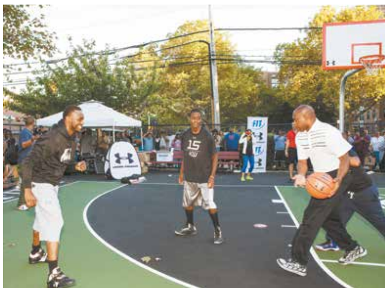
Kemba Walker, a player for the Charlotte Bobcats and former NYCHA resident (left), and Nate "Tiny" Archibald, former NBA player and NYCHA resident (right), play with NYCHA youth at a refurbished basketball court at Sack Wern Houses on September 19, 2013.

That he did. The Charlotte Bobcats point guard, who recalls shooting hoops and playing with friends on the court when it wasn't too run down for use,