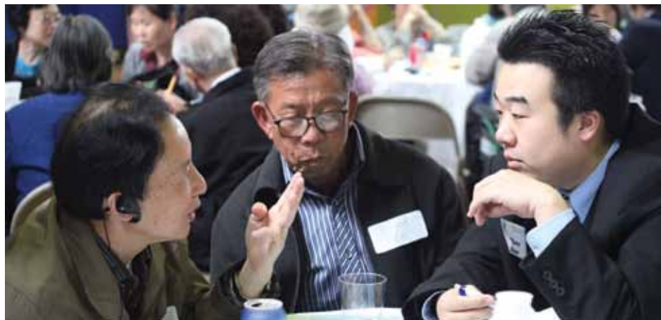
NYCHA residents and staff discuss the future of the Authority – and how it will be reached together – at the Community Conversation held on May 14, 2011, at the Rutgers Community Center in Manhattan.

The Community Conversations will help shape the Plan to Preserve Public Housing, NYCHA's comprehensive plan