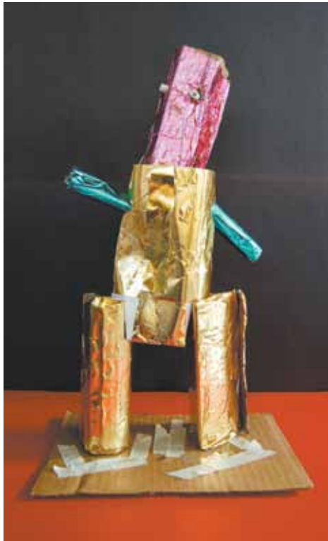
Skylar Grady, Brevoort Houses, Youth, Robot