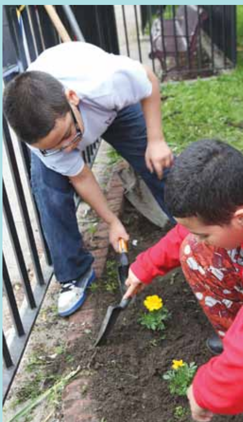
NYCHA youth plant flowers on May 23, 2011, at a community event held by the Ravenswood Houses Resident Green Committee.