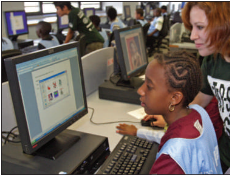
St. John's Summer CampUS provides youth with educational opportunities at the St. John's Campus in Queens, to help them be better prepared for school in the fall.