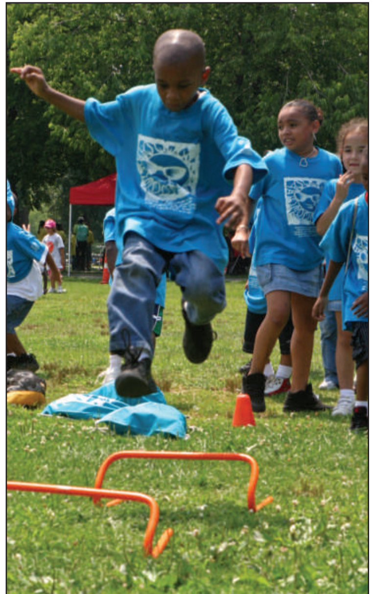
An obstacle course was never as much fun as it was at Sports Education Field Day at Van Cortlandt Park in the Bronx on July 26th (above). And two young residents show off the fish they caught at the Fresh Air Fund Day Camp in Fresh Kills, New York in August (left). Don't worry, that fish went right back in the water in this "catch and release" activity.