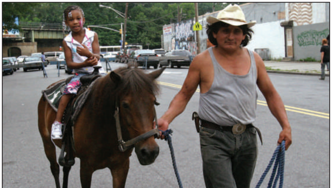
More fun at Night Out Against Crime at Boston Secor Houses in the Bronx (above) on August 7th and at the Citywide Olympics on August 17th in Riverbank State Park in Manhattan (left).