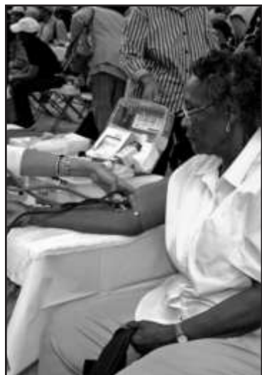
A senior has her blood pressure taken at the Benefit Fair.