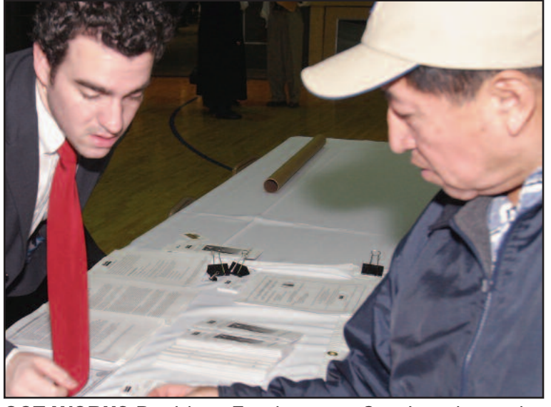
GOT WORK? Resident Employment Services hosted a Career Expo in Williamsburg on February 2nd.