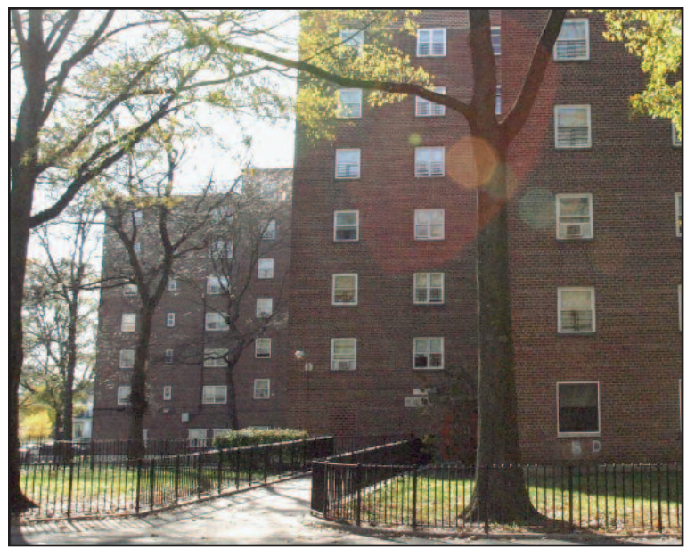
DRUG BUST Redfern Houses in Far Rockaway was the site of a major drug sweep last month.