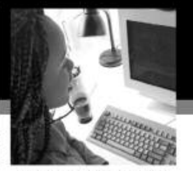
FLEXIBLE SCHEDULES AND ONLINE CLASSES