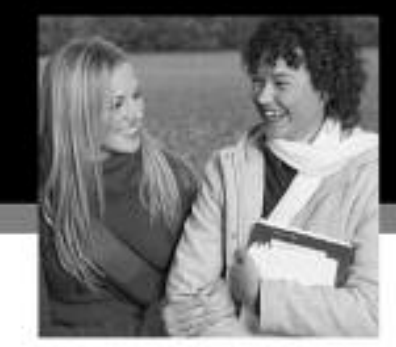
TOP QUALITY EDUCATION