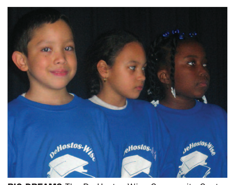
BIG DREAMS The De Hostos-Wise Community Center in Manhattan is the newest "I Have A Dream" site.