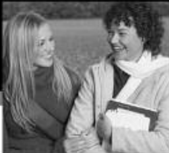
TOP QUALITY EDUCATION