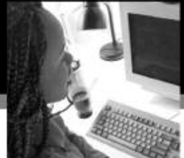
FLEXIBLE SCHEDULES AND ONLINE CLASSES