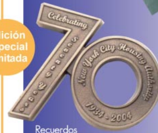
Edición Especial Limitada