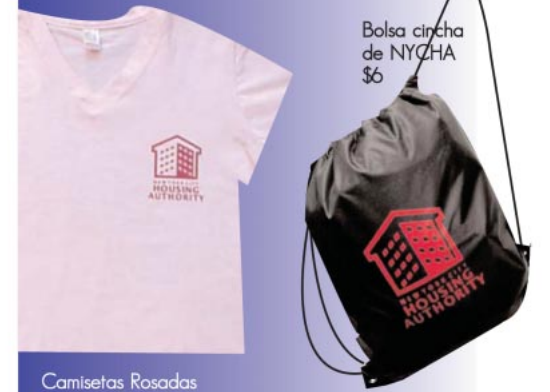
Bolsa cincha de NYCHA $6