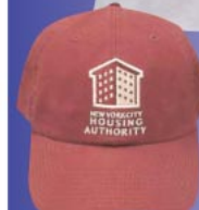
Gorras de NYCHA Negro/Marrón/Caqui $7