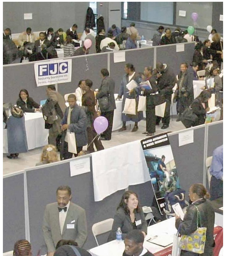
EMPOWERMENT THROUGH EMPLOYMENT One-hundred companies were represented at the 2005 Job Fair/Career Info Expo at Brooklyn's Polytechnic University.