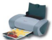
Impresora a Color $50