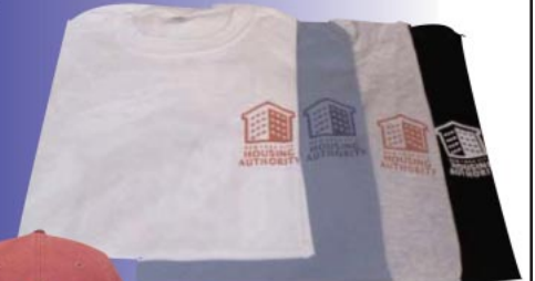
Camisetas de NYCHA Negro/Blanco/Gris/Azul claro $10