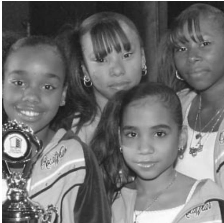
2 Hot 2 Handle is the name chosen by these proud young dancers from Bronx River Houses. They won second-place in the very competitive 6-15 Age Category.