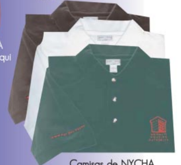
Camisetas de NYCHA Blanco/Verde/Negro S-M-L-XL-2X-3X $20